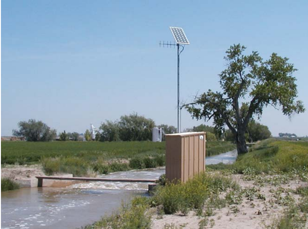
Figure 1. An example of a rated canal section which is remotely monitored using a SCADA system. RTU equipment is 12-volt DC powered from a solar panel that maintains a charge on a battery. Communication with the site is via radio.

The HMI screen can be, and should be, unique to the user and the circumstance. Figure 2 shows an example of the HMI screen in use by district staff at the Dolores Project near Cortez, Colorado. This screen is simple and intuitive in nature. Radial gate (check structure) positions are depicted graphically, each in a somewhat lower position in the HMI screen, to indicate the canal itself. The operator may raise or lower gates, and therefore water surface elevations in canal pools, by using very small incremental gate movements. Interestingly, Delores Project staff can and do make changes in their own HMI software interface without assistance from an outside consultant or system integrator.