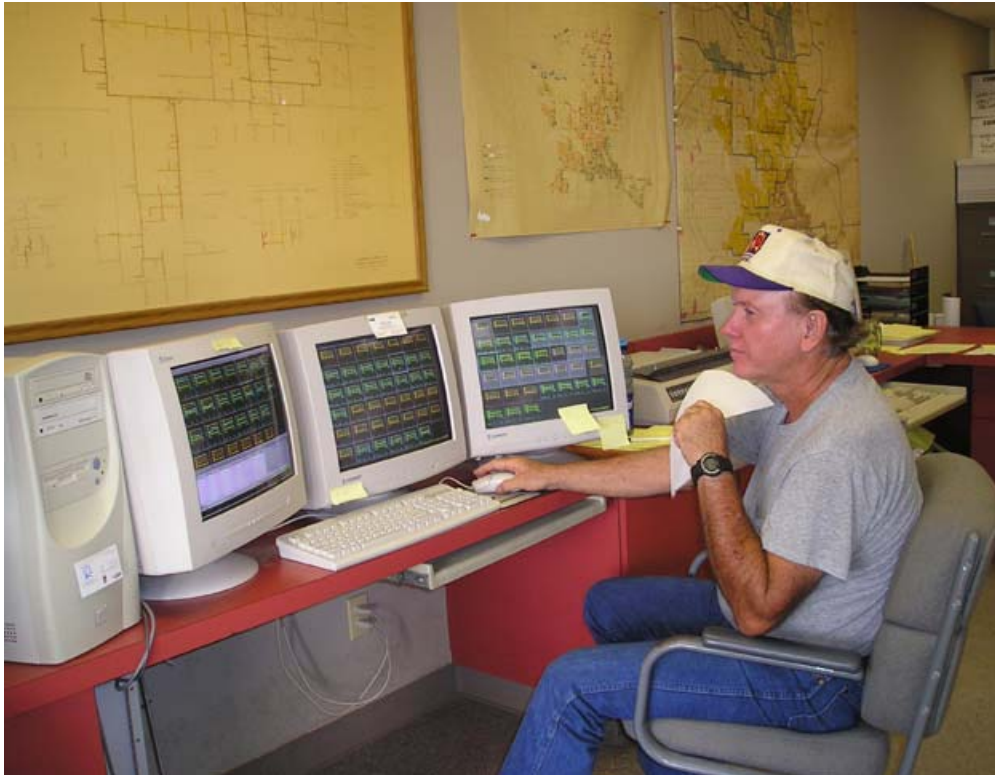
Figure 4. An operator at the Central Arizona Irrigation and Drainage District (CAIDD) near Phoenix monitors primary flows and water surface elevations in the 60-mile canal. This SCADA system was implemented at relatively low cost using affordable RTU equipment and spread spectrum radios for communication.

Most of the district's checks are operated in remote manual mode. See Figure 4 which shows the day operator at the central system where the upstream water surface elevation at all 108 check structures can be viewed simultaneous with three side-by-side computer monitors. Using SCADA, gate adjustments can be made in increments of 1/8 th inch which coincidentally equates to a change in flow of roughly one cubic foot per second through the check.