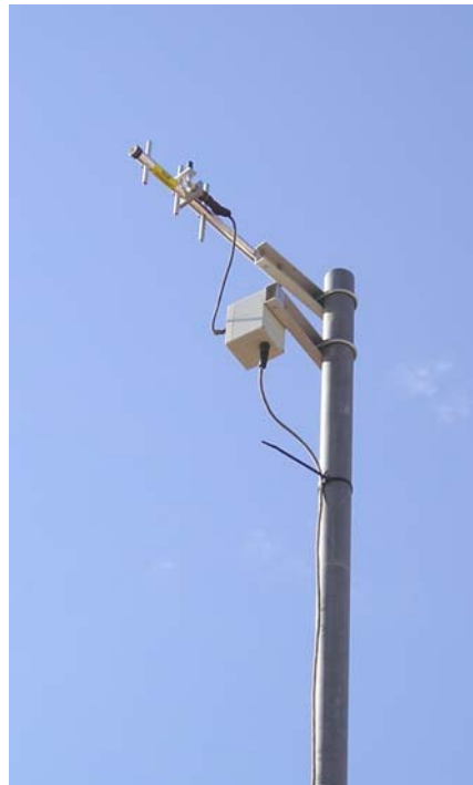
Figure 5. The SCADA system at Central Arizona Irrigation and Drainage District (CAIDD) uses spread spectrum radio which is a relatively new type of radio system that does not require federal licensing. The spread spectrum radio is housed in the white enclosure and the directional antenna shown has a line-of-sight range of approximately 5 miles.

Figure 5 shows a spread spectrum radio and a directional antenna installed on a galvanized steel pipe at one of CAIDD’s check structure sites.