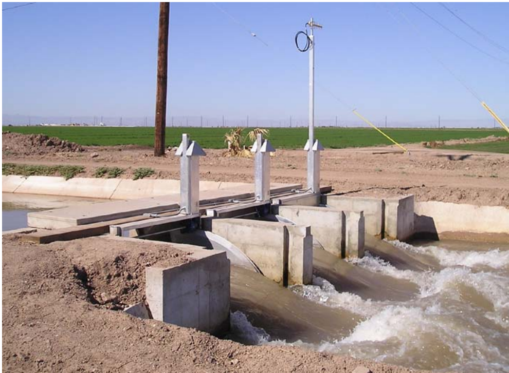
Figure 3. This check structure is controlled by Rubicon gates which are integrated with the SCADA system and used for water surface level control or flow control..

The Central Arizona Irrigation and Drainage District (CAIDD) has implemented SCADA over much of the district's 60 miles of canal. CAIDD has utilized SCADA for many years but it is noteworthy that they have in recent years upgraded their old SCADA system at a relatively low cost. With the upgrade, using the existing gates, actuators, and other infrastructure, the district staff installed new SCADA equipment on 108 sites for an equipment cost of approximately $150,000.