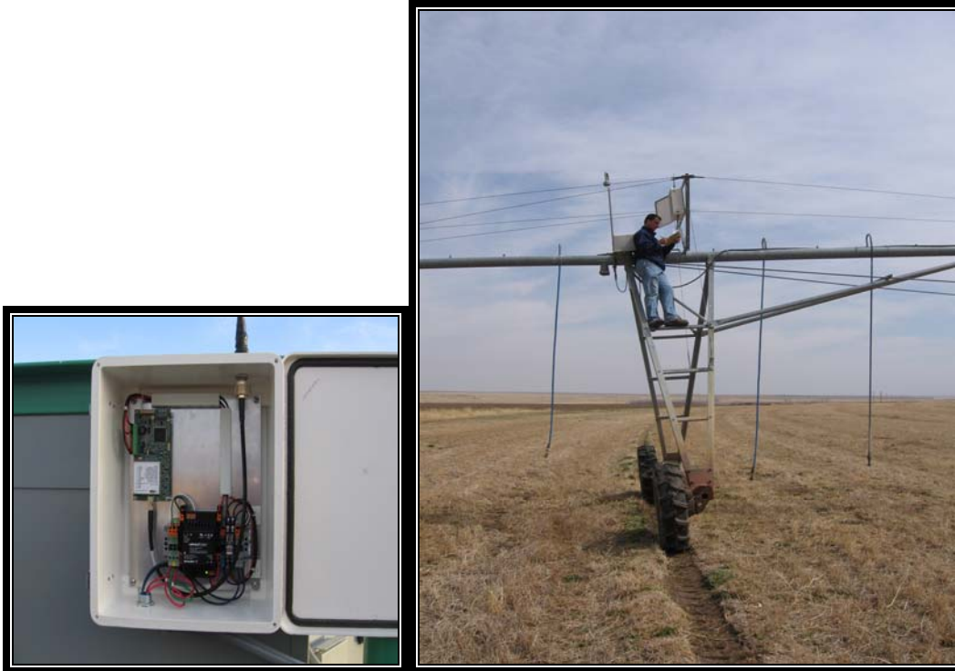
Figure 7 and Figure 8. AmWest, Inc. installing a control box with a 900 MHz Spread Spectrum Radio