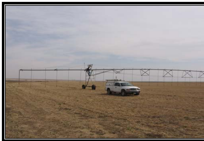
Figure 1. AmWest, Inc. installing pivot control box.