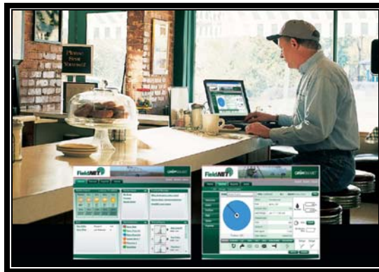
Figure 4. Lindsay Irrigation Field NET Software

The latest telemetry trend is “wireless instrumentation” or being able to control and/or monitor analog and digital signals without the constraints of wire. These signals may be used to communicate to and from the pivot to the farm to check moisture and temperature sensors, chemical soil samples, wind speed for the best time to water, the actual pivot location and pump power usage that can be viewed anytime. The capability with Web Internet access allows the entire pivot system to be viewed via a smart telephone or the user can look at a Website anywhere to have access to all the data and view the pivot irrigation system remotely. With this technology, the user of the farm can remotely operate the pivot system, report and view status changes, and see the remote sensors’ status. Until recently, all of these field devices that had to be hard-wired, or use expensive cellular or satellite communication hardware, now can be done wirelessly and without any cost to the user using unlicensed spectrum with “spread spectrum 900MHz radios.” These radio products also can have input and output control functions built right in or can integrate into a remote terminal unit (RTU) or some other type of control device. One way they can send this information from the sensors to the host is using standard Modbus protocol and assigning Modbus registers to the field input devices.