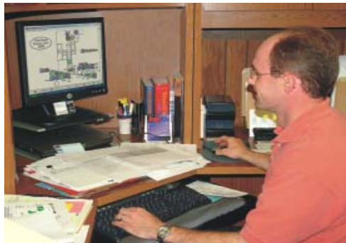
Figure 2. Automated pivot irrigation SCADA system software by Reinke Irrigation

With many new telemetry technologies available today, it is common to have 100 percent communication to all farm pivot locations and see data throughput from pivot sites of 19.2 kbps up to 115.2 kbps. Additionally, high speed backbone telemetry is available with both serial and Ethernet connectivity with speeds close to a megabit per second range. With the use of IP wireless devices, MPEG4 IP Ethernet cameras can be added to the system for remote viewing of the pivot system and to check on the field crop or farm conditions. In addition, hybrid wireless systems can be utilized where needed to combine different wireless technologies over large geographic areas or remote locations. This can include both cellular, satellite and microwave products that can be deployed for remote areas, or if a higher speed backhaul of data is required.