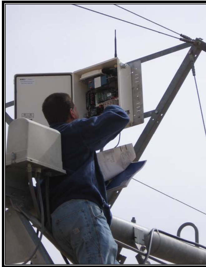
Figure 6. AmWest, Inc. installing the Pivot Controller with 900MHz Radio

several Modbus nodes at once, even if they are connected with different interface types, without the need to use a different protocol for every connection.