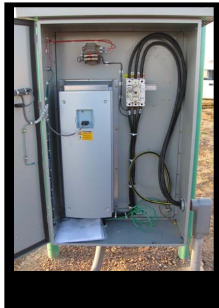
Figure 10. New variable frequency drive for the pivot irrigation water pump that will save energy costs and help prolong the pump life.