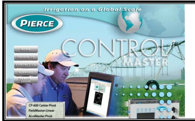
Figure 5. Pierce Irrigation Control Master software and controller