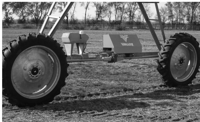
Figure 2. Engine span drive