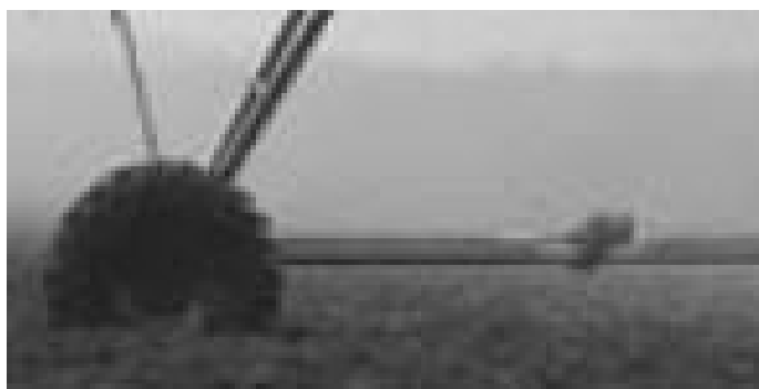
Figure 3. Electric span drive