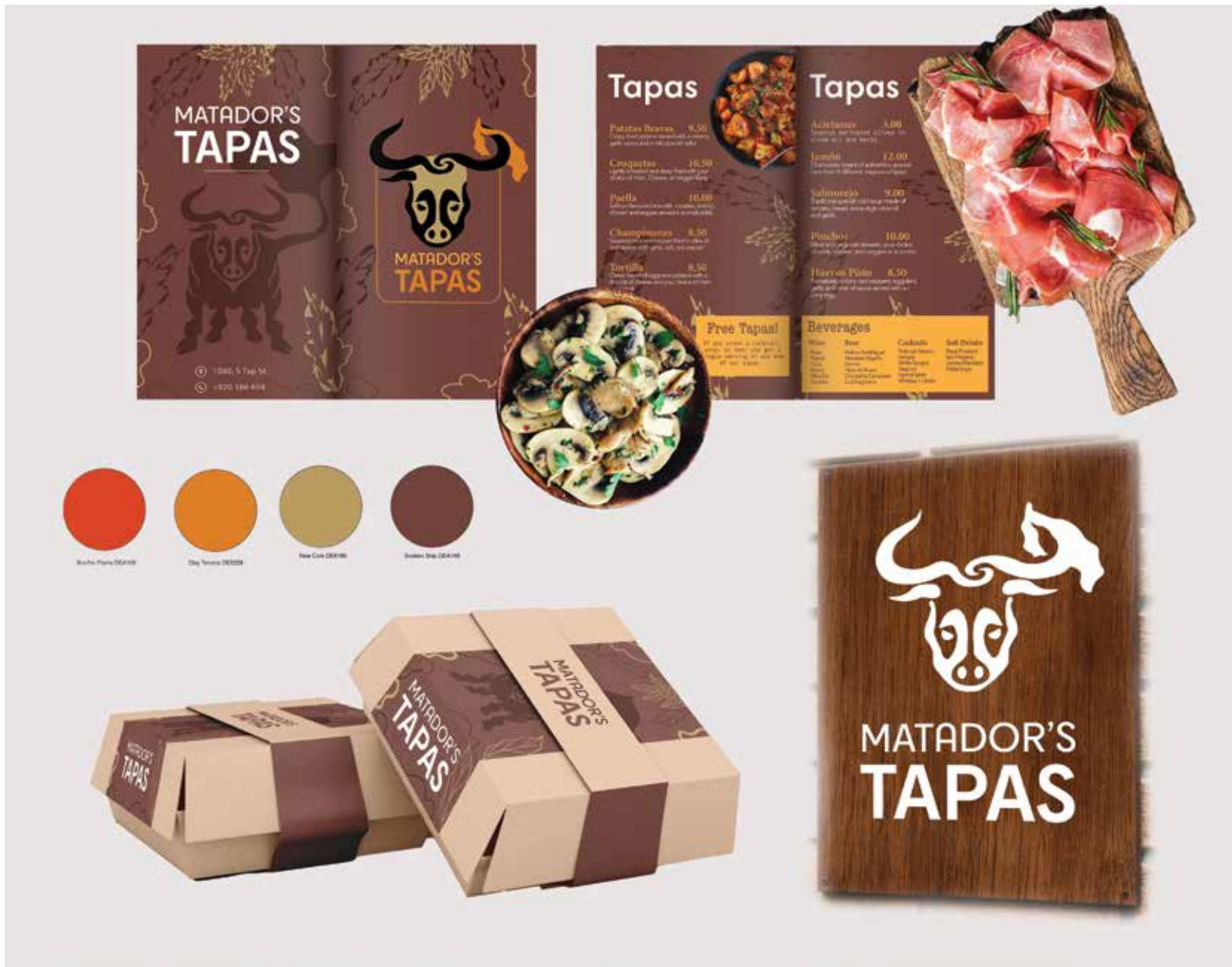
Figure 8: Matador's Tapas - Restaurant Brand