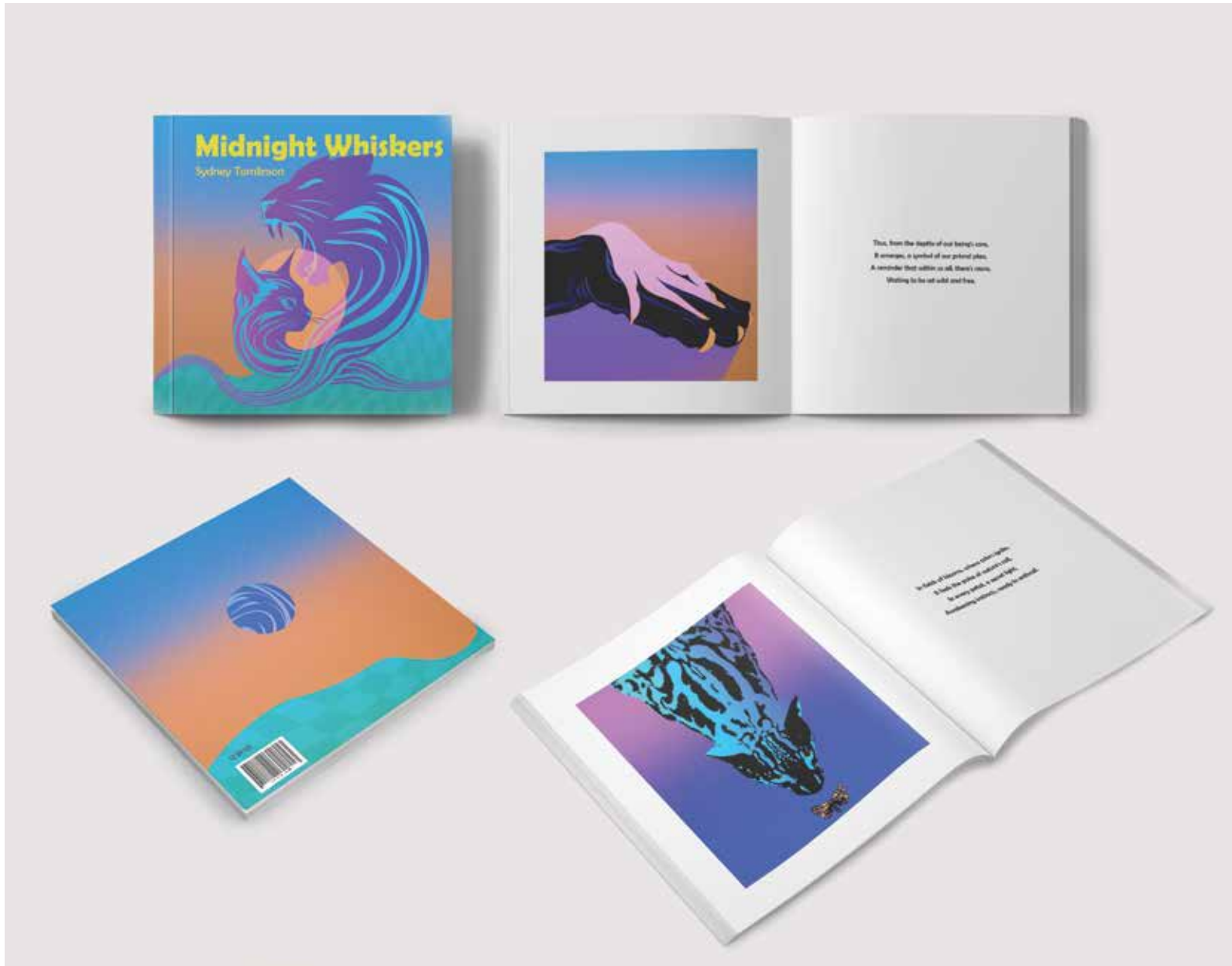
Figure 4: Midnight Whiskers - Illustrated Book