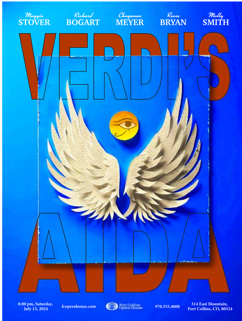
Figure 1: Aida Poster