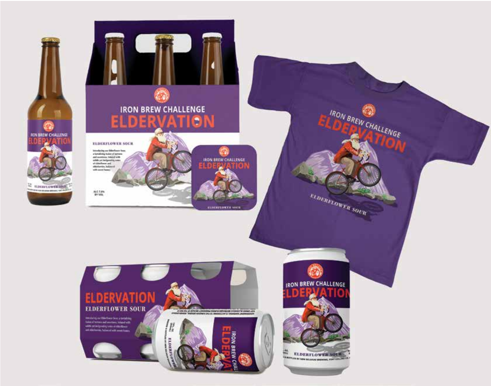
Figure 3: Eldervation - Iron Brew Challenge