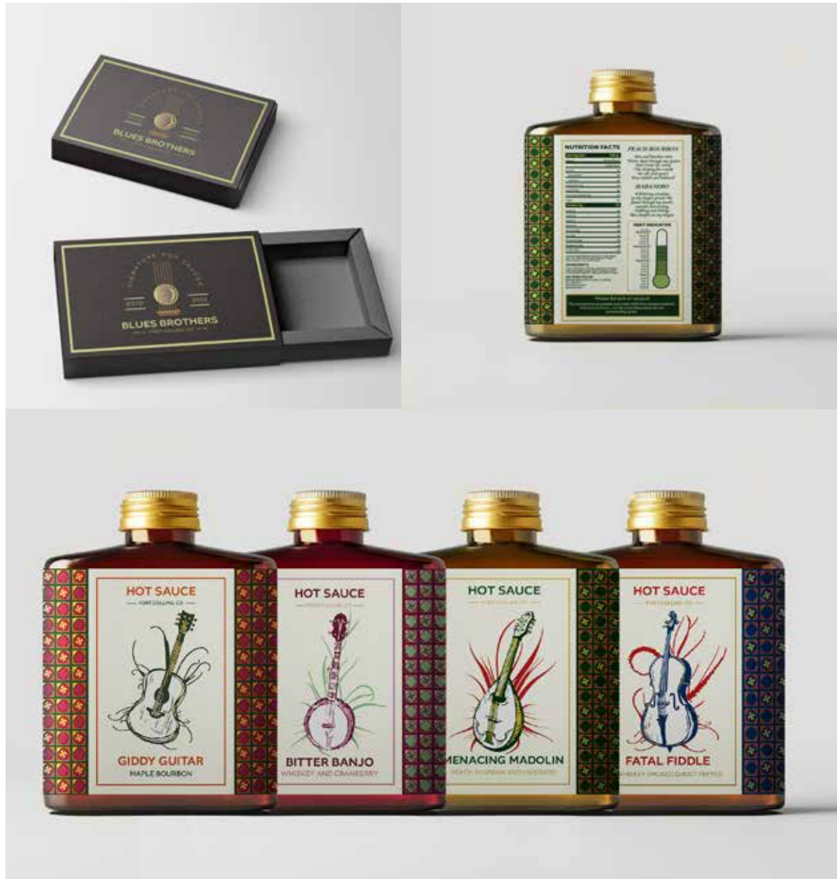
Figure 5: Blues Brothers - Hot Sauce