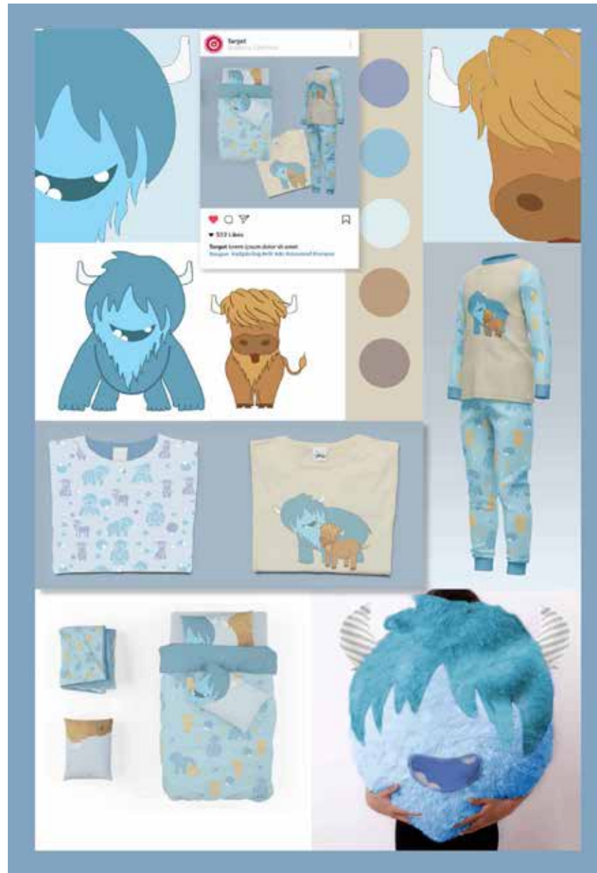
Figure 6: Highland Harmony - Childrens Brand