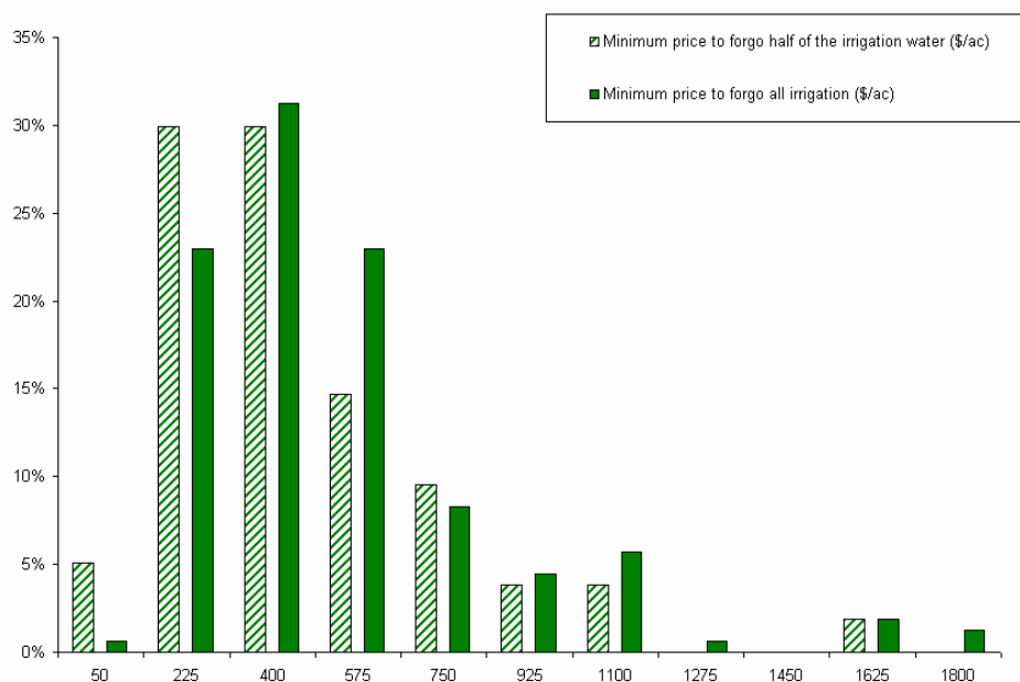
Figure 2. Respondents' minimum payment to forgo one-half of their irrigation water and to forgo all irrigation water for one year.

In another open-ended question, respondents were asked to indicate the minimum price they must be paid in order to forgo one-half of their irrigation water for one year as part of a leasing arrangement – one example of limited irrigation. These results are illustrated in Figure 2 along with the rotational fallowing results in Figure 1.