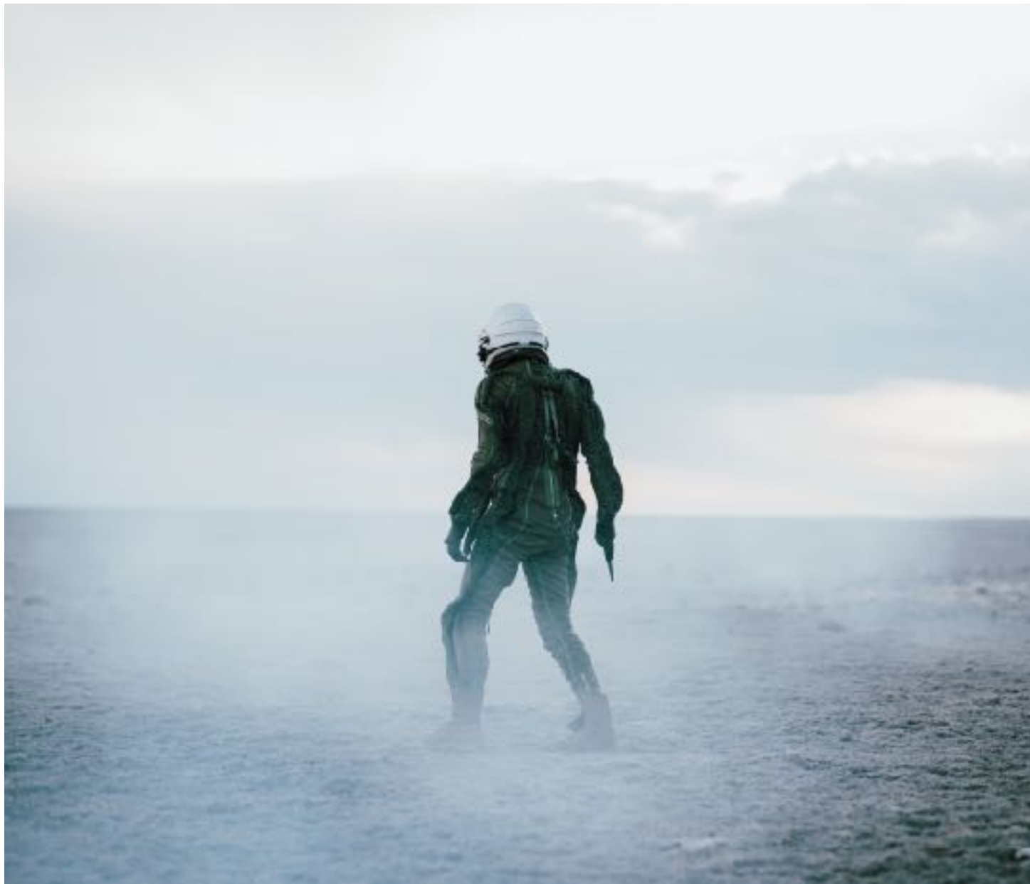
Figure 6: “Return to Earth” part 1