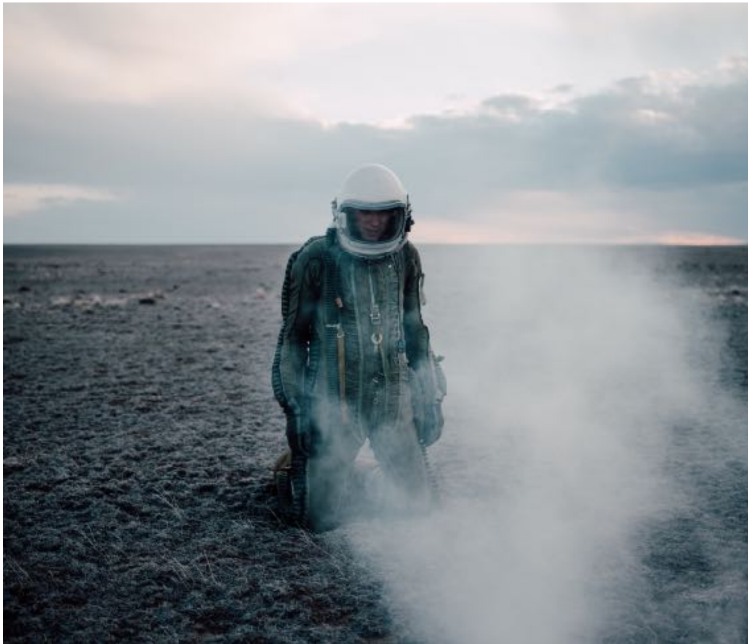
Figure 8: "Return to Earth" part 3