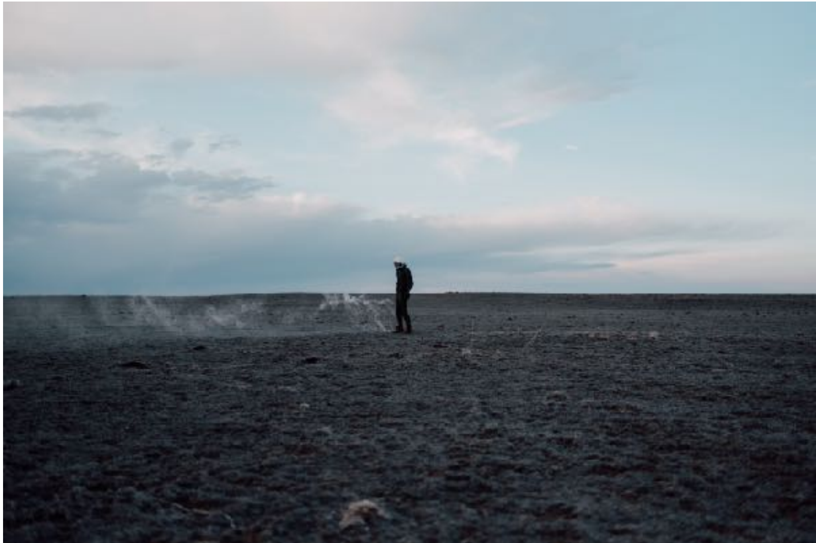
Figure 7: “Return to Earth” part 2