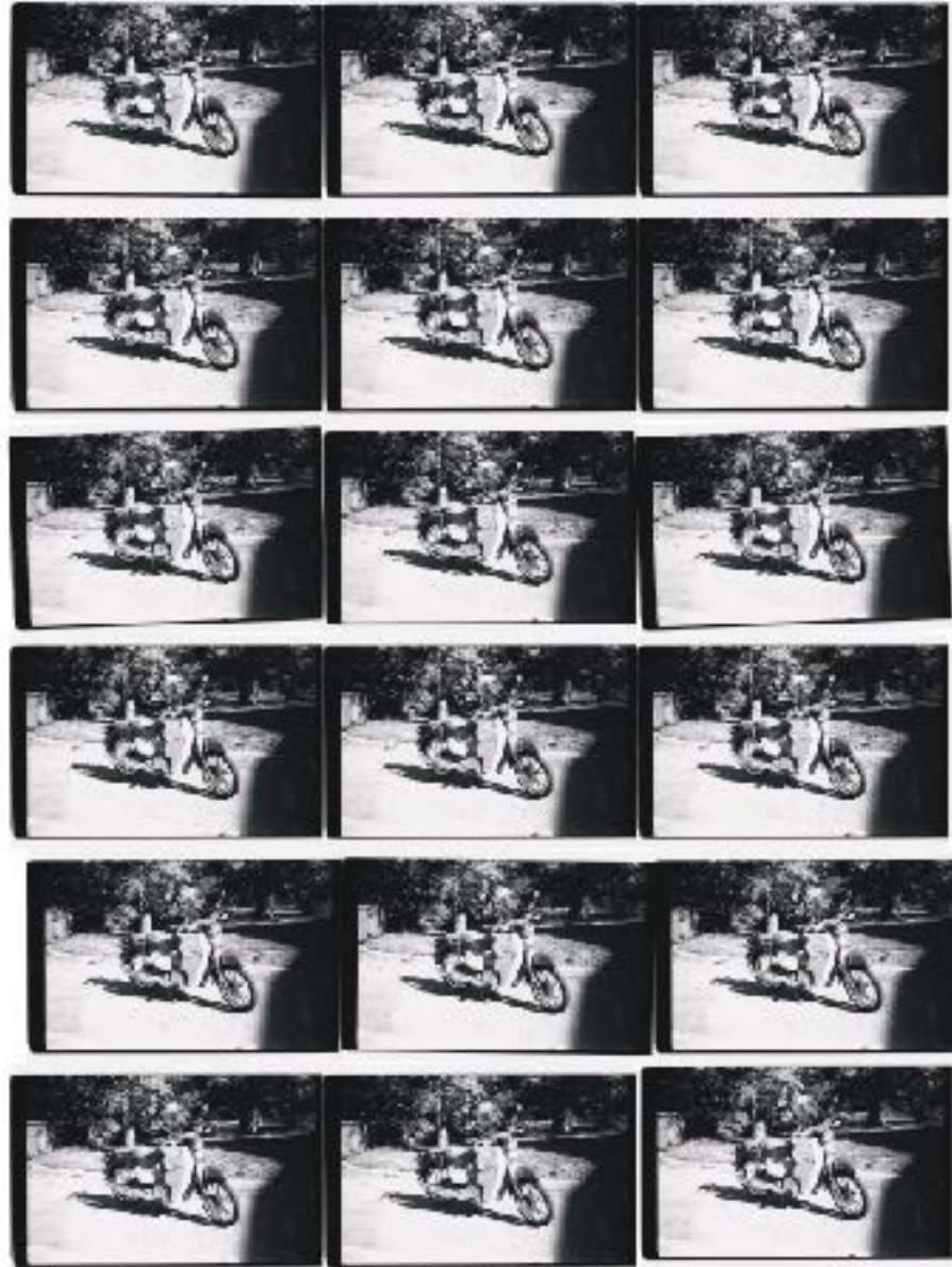
Figure 4: "Honda Cub 18 Times"