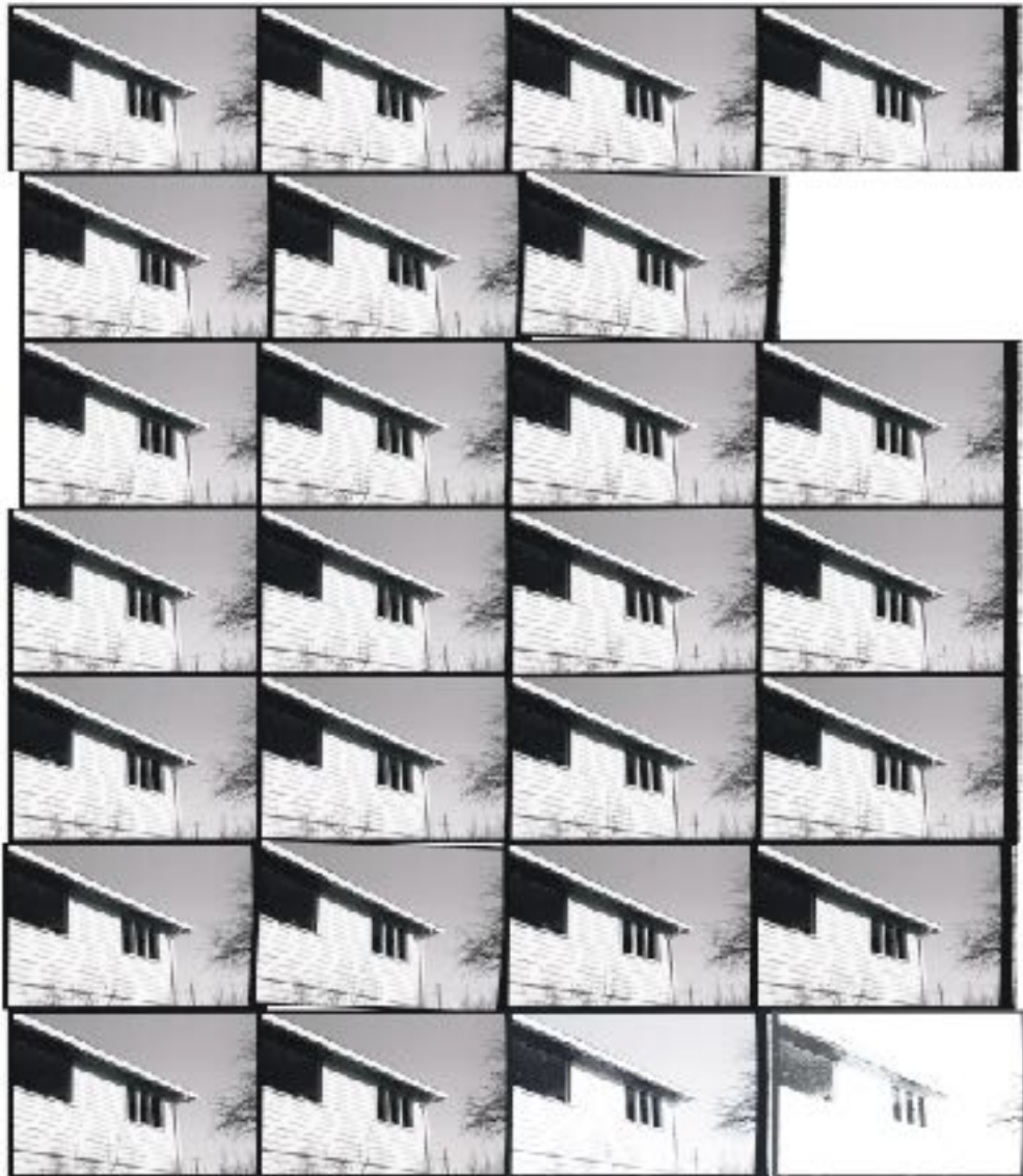
Figure 3: "Nuclear Household"