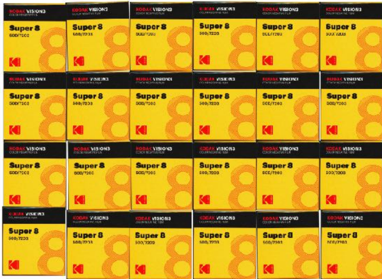
Figure 2: "Super 8"