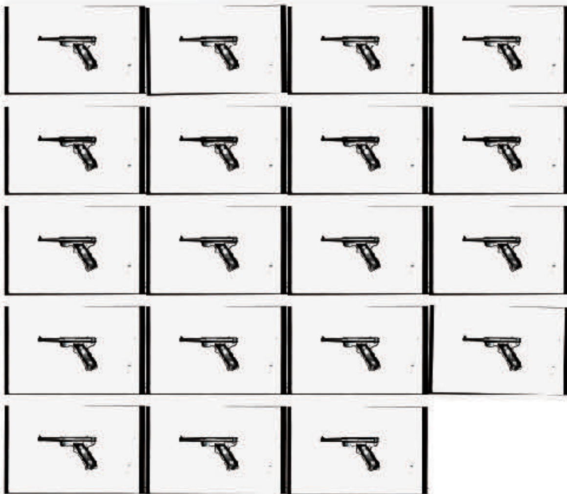
Figure 1: "Ruger Standard 19 Times"