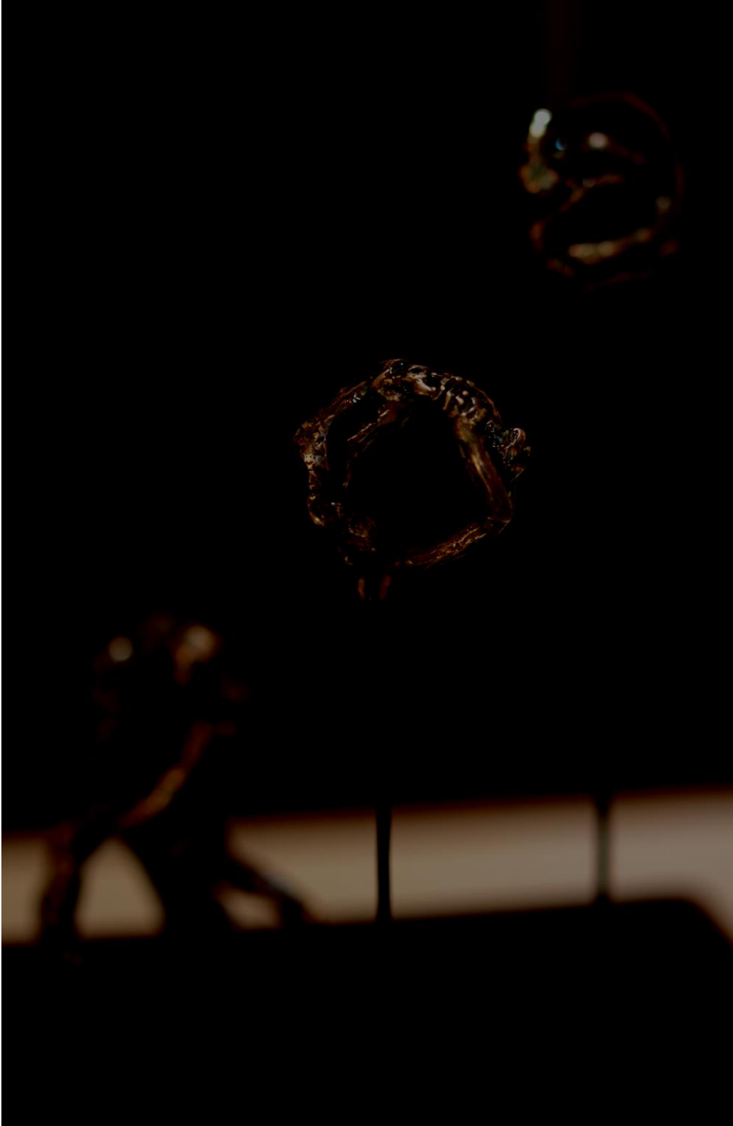
Figure 2: Mine, Yours, and Everyone Else's (view 1)