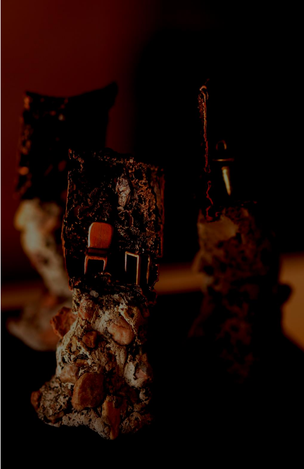
Figure 9: Place of Mind (Effortless Conformity, Freedom of Immorality)