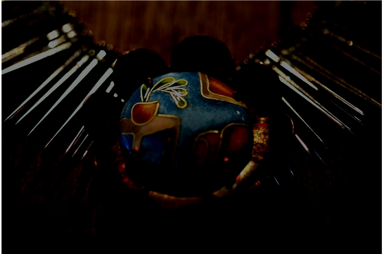
Figure 5: Keep Your Chin Up, Honey