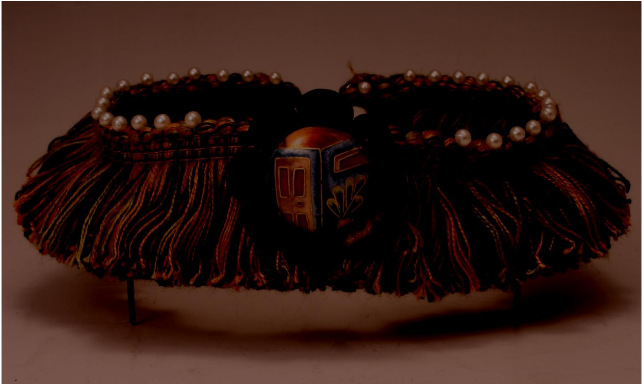
Figure 4: Don't Let Them Look Through the Curtains