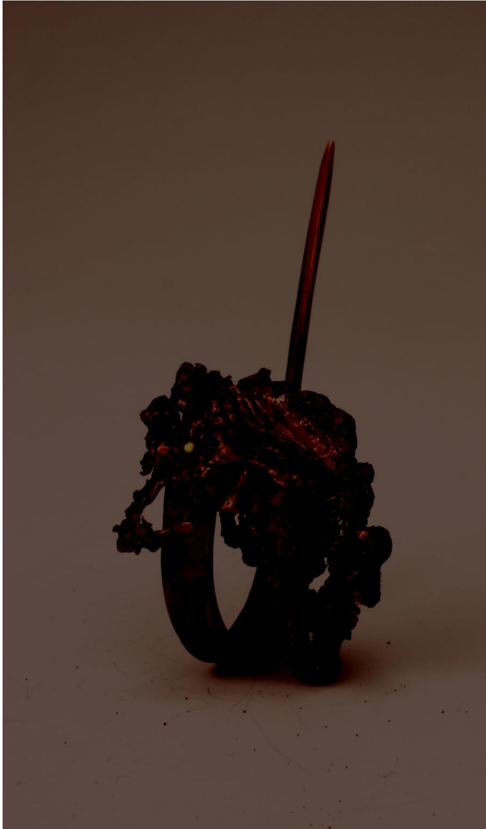
Figure 7: Impermanent Tenacity