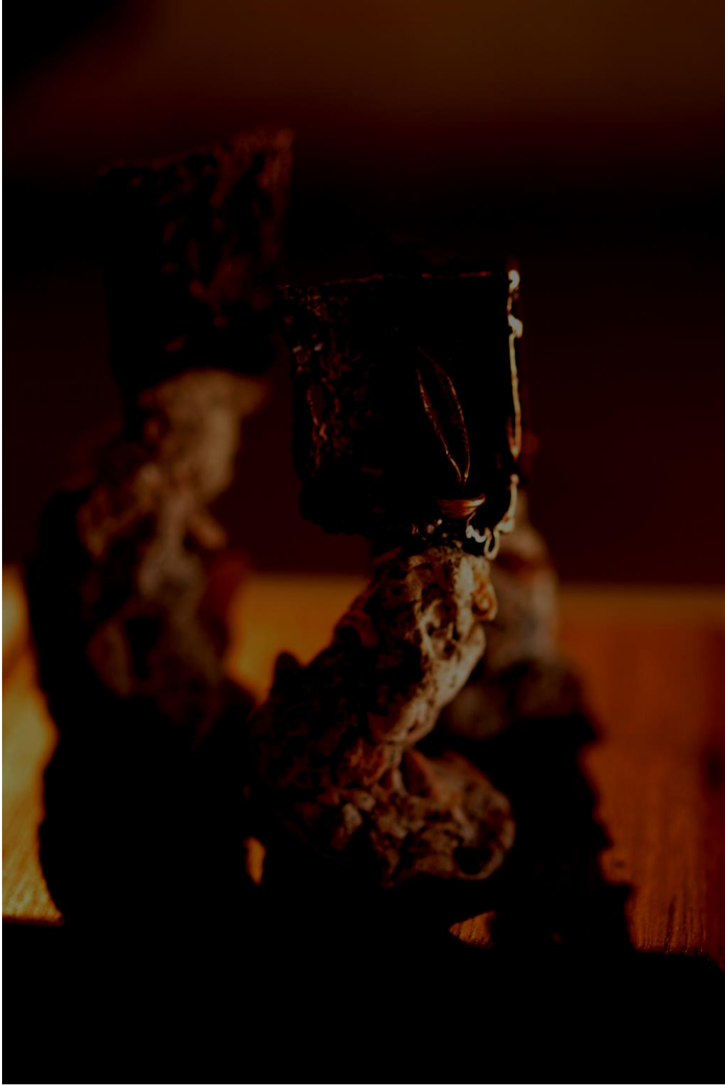
Figure 10: Place of Mind (Rising to the Level of Ordinary)