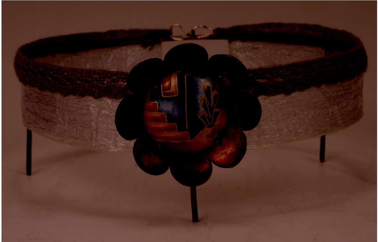
Figure 6: Forever Preserved in Your Fantasy