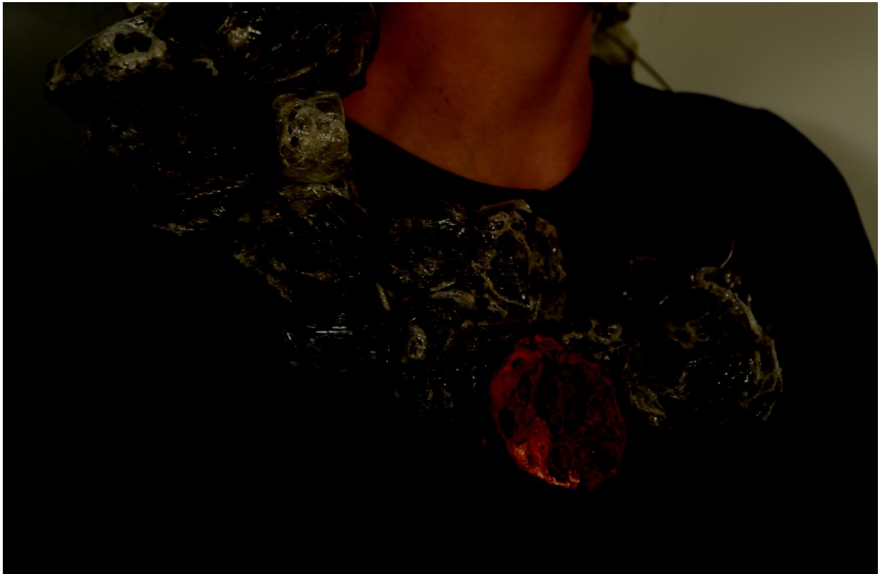
Figure 1: Make(it)up to Me