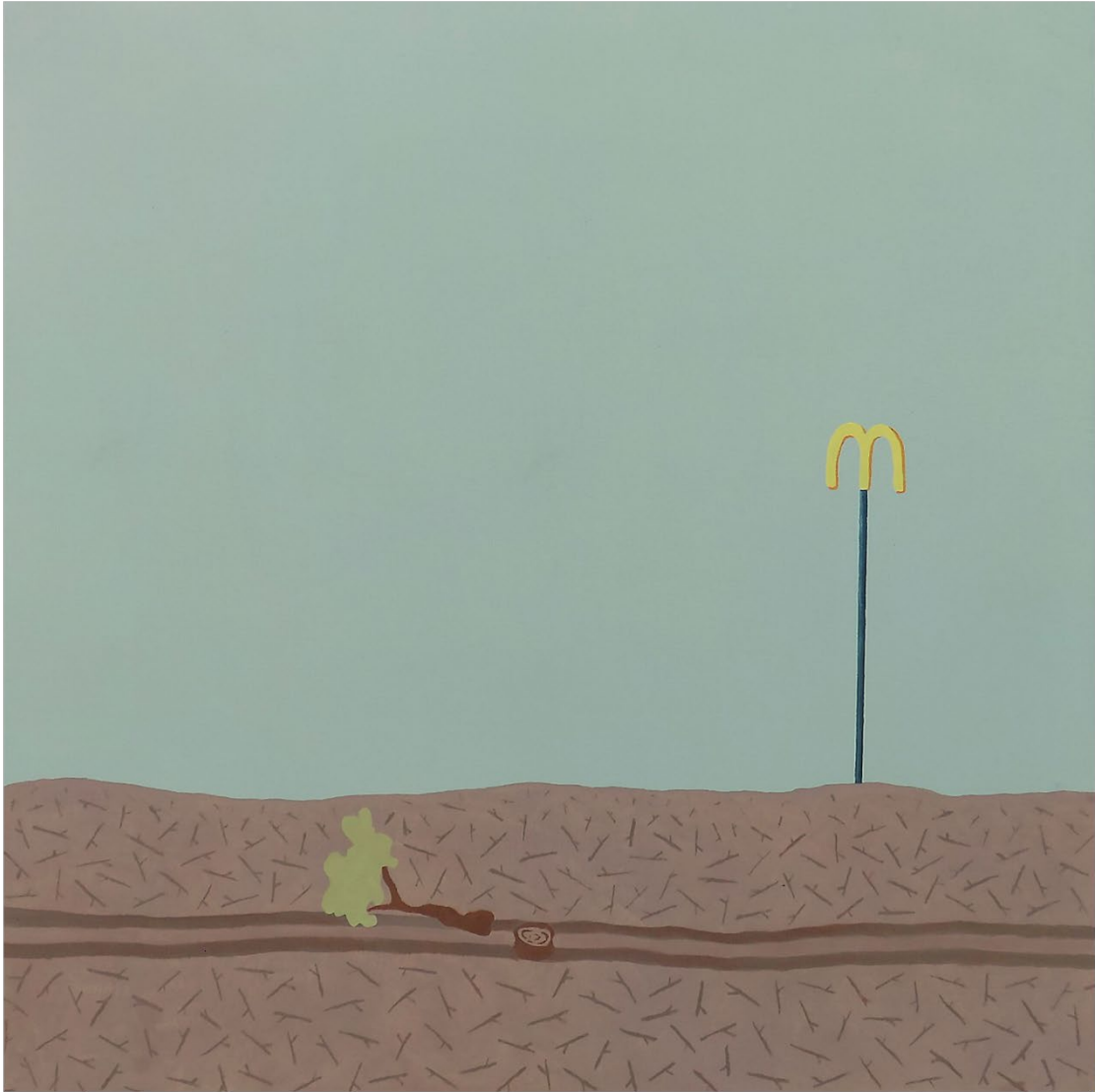
Figure 8: Untitled (Jungle)