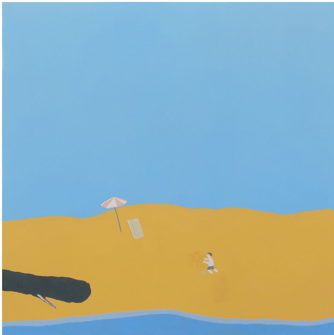
Figure 7: Beached Whale