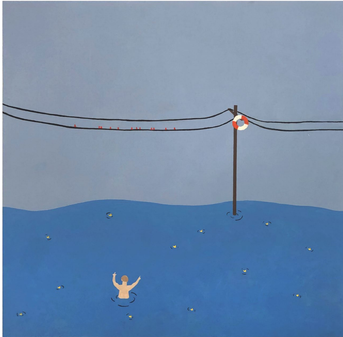
Figure 5: Rubber Ducks