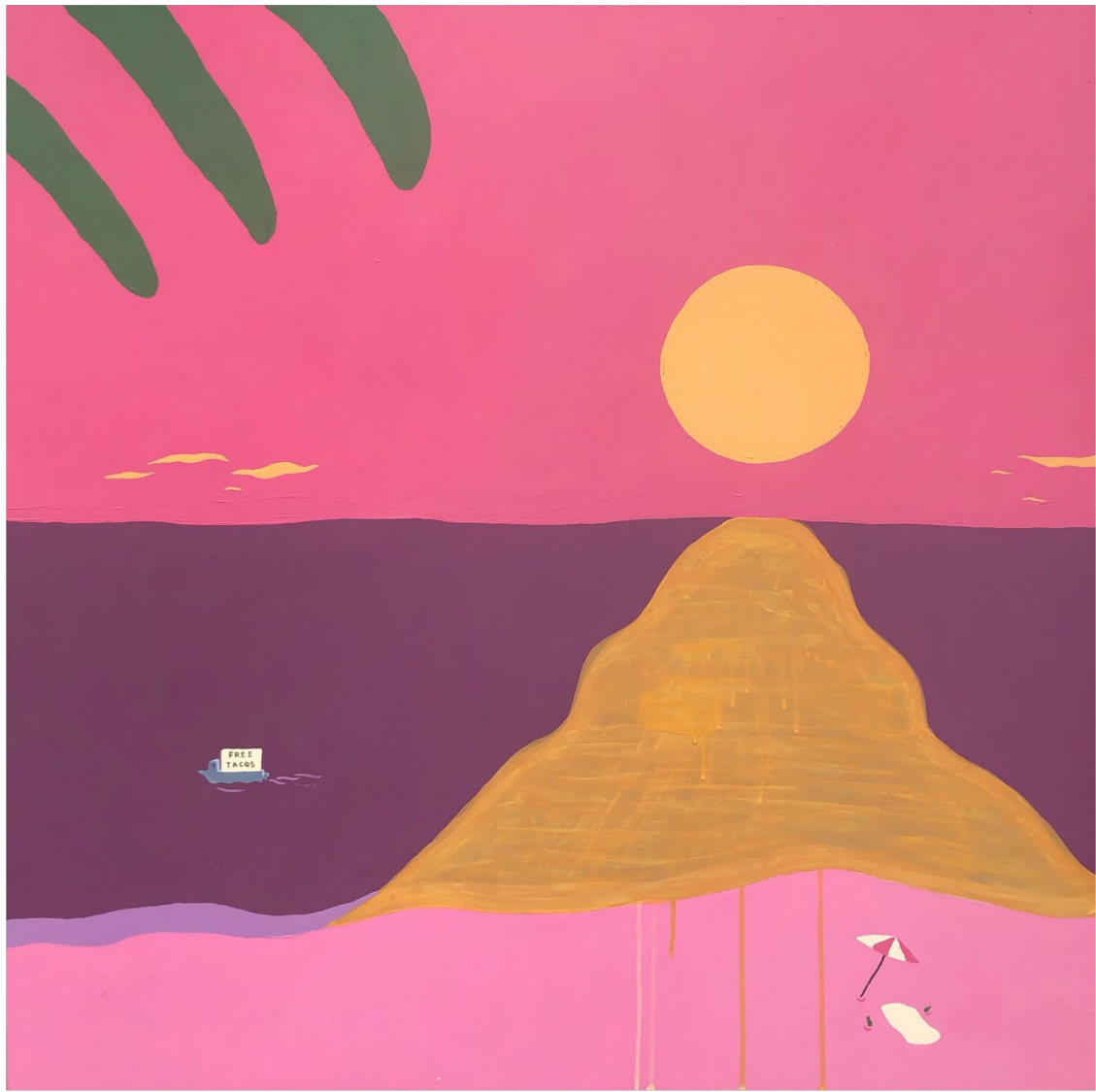
Figure 2: This Billboard Boat Is Really Getting In The Way Of My Shot