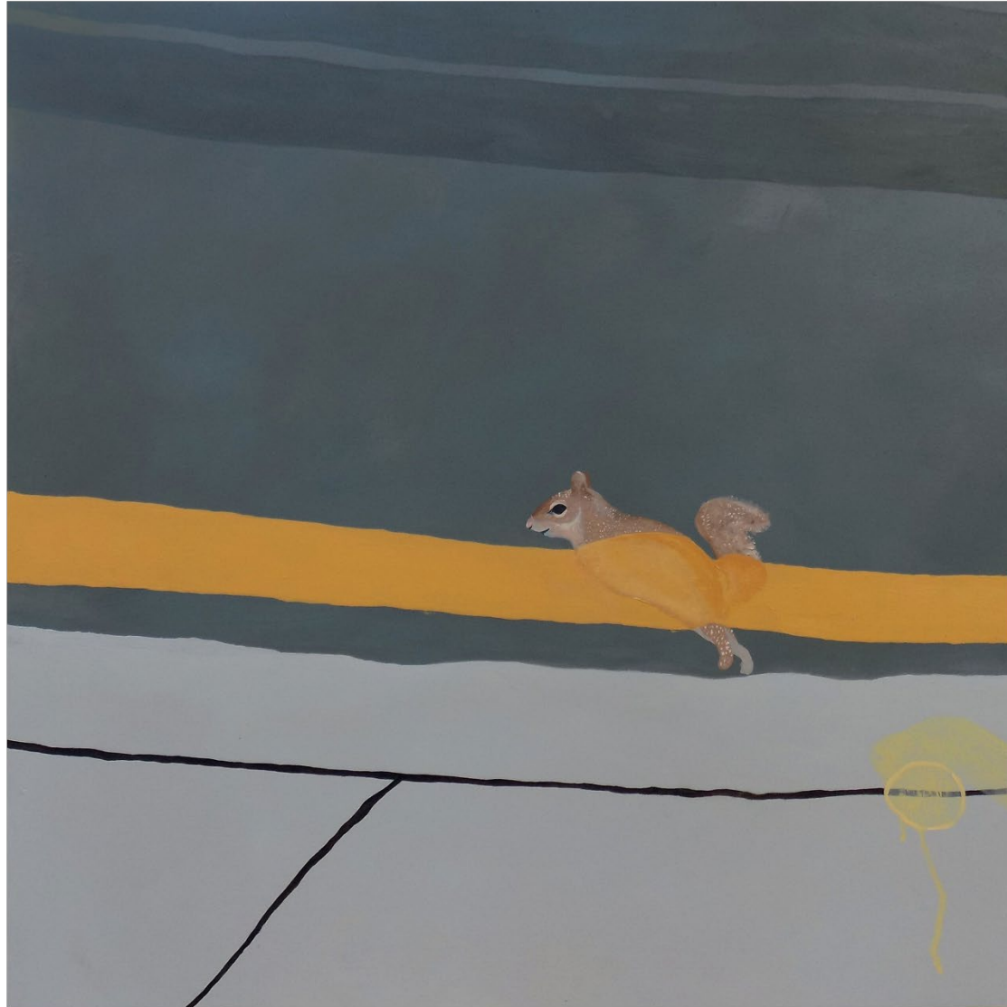
Figure 9: Squirrel and Line and Condom