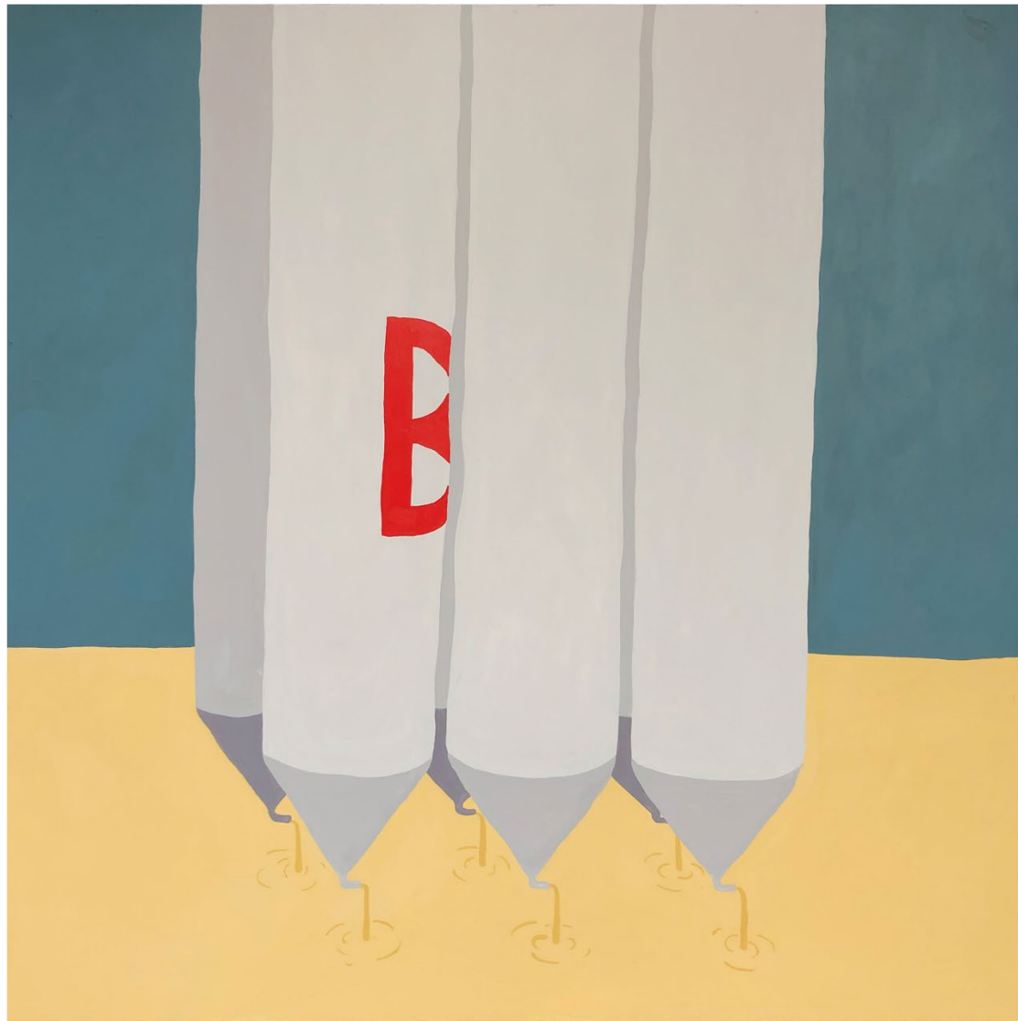
Figure 3: What Do I Call Bullshit? A Contemporary Dilemma