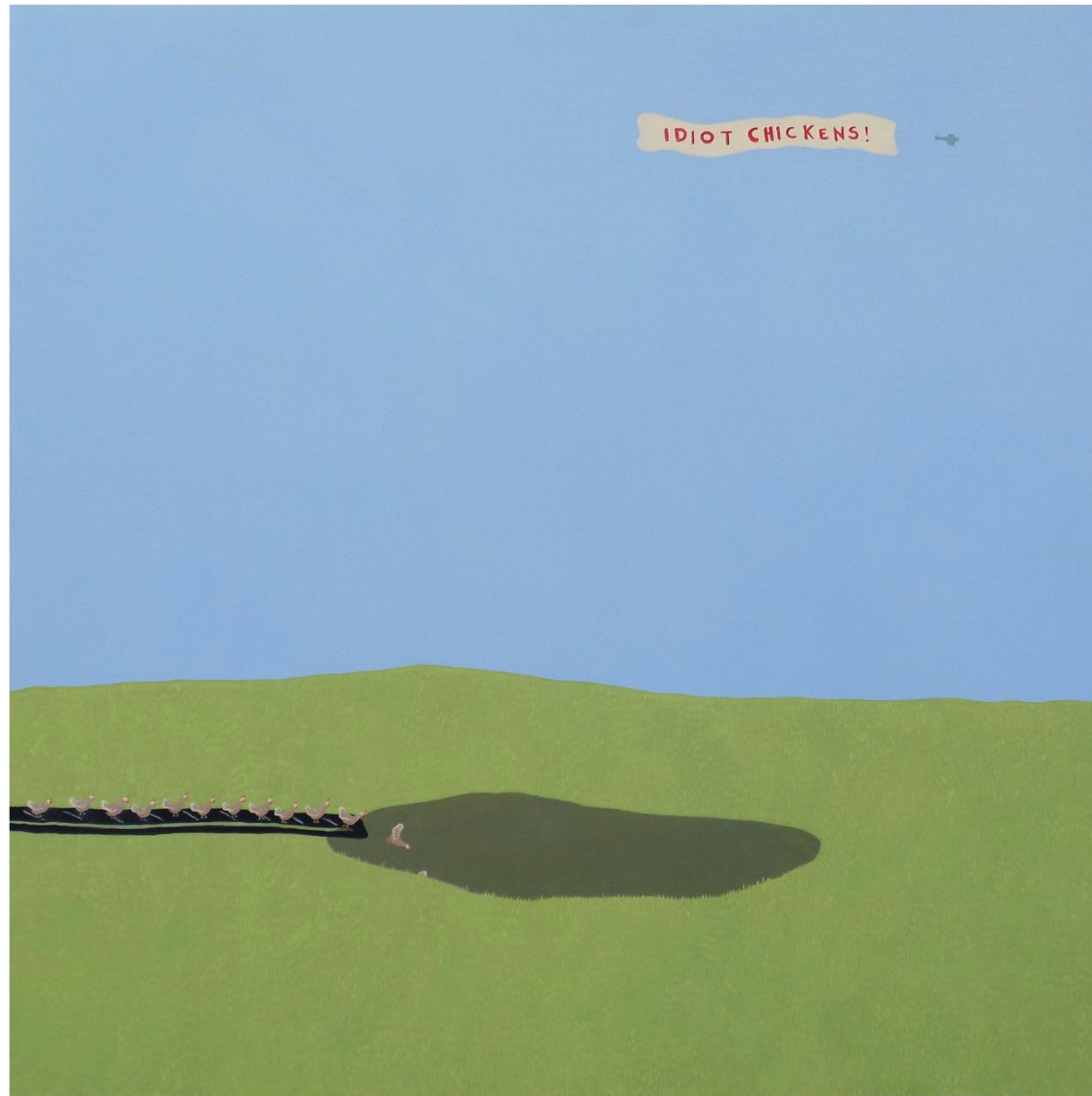
Figure 4: Idiot Chickens!