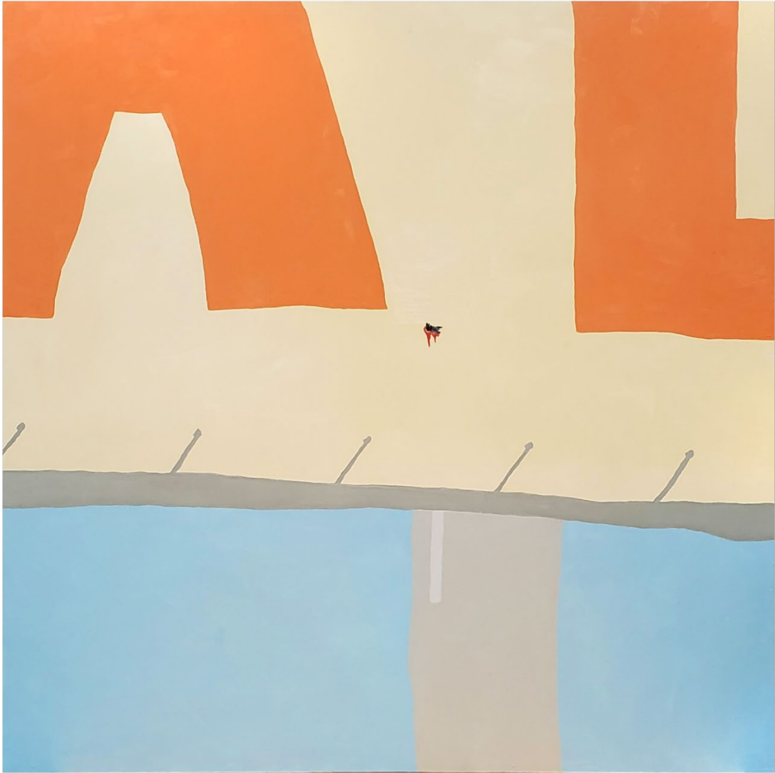
Figure 6: SALE