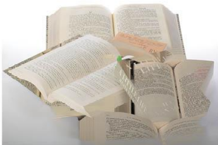
Figure 5: Fiction