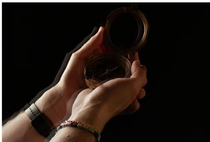
Figure 1: Luck