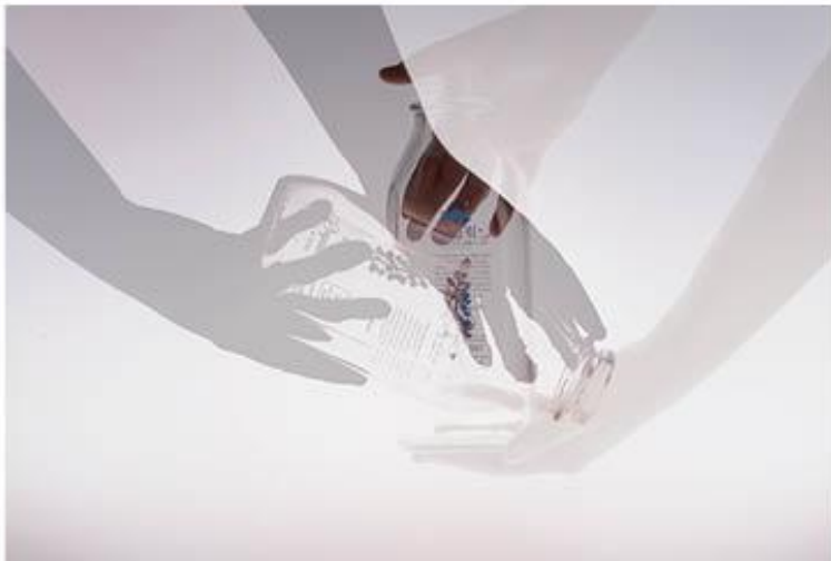
Figure 8: Home