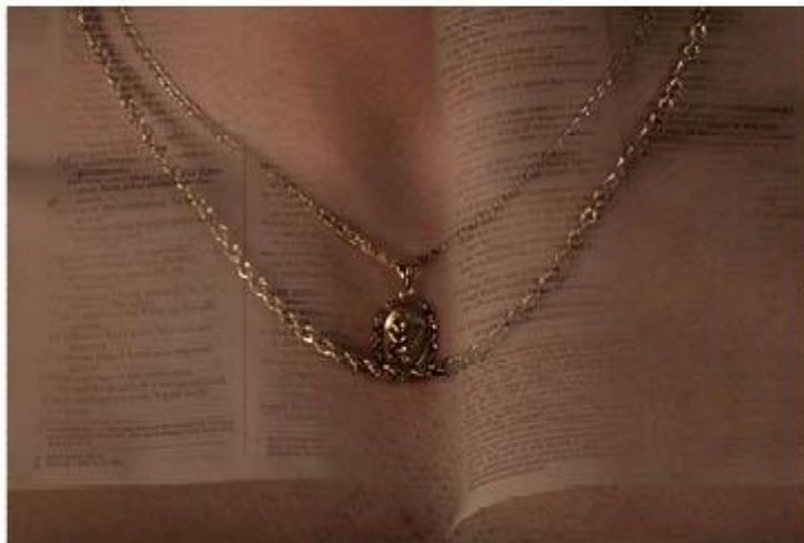
Figure 4: Faith