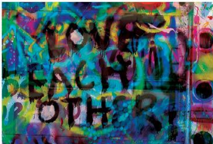
Figure 9: Graffiti