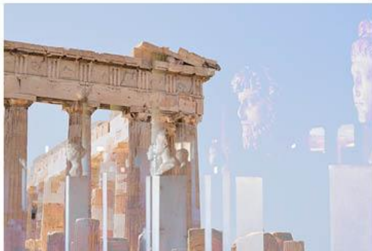
Figure 6: History