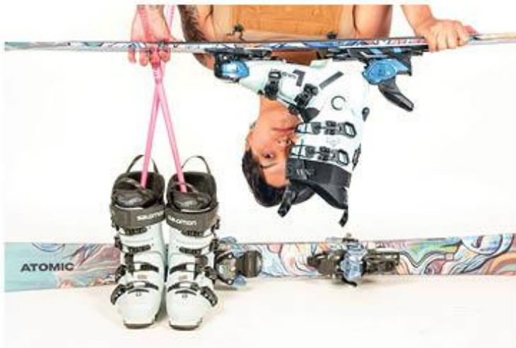
Figure 2: Downhill