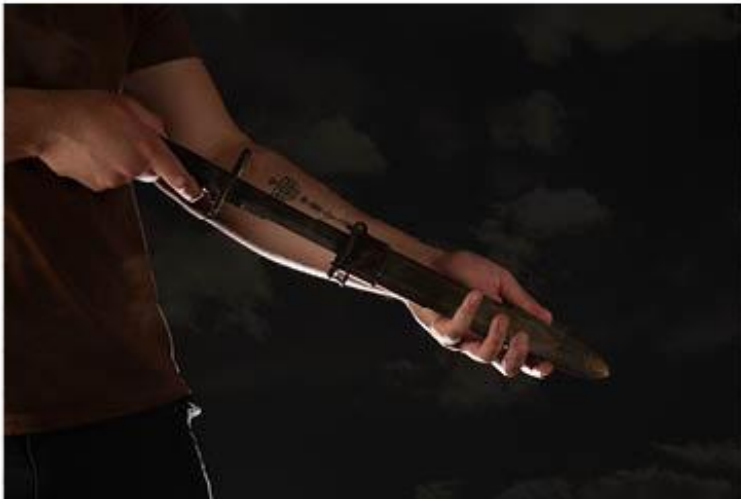
Figure 7: Family