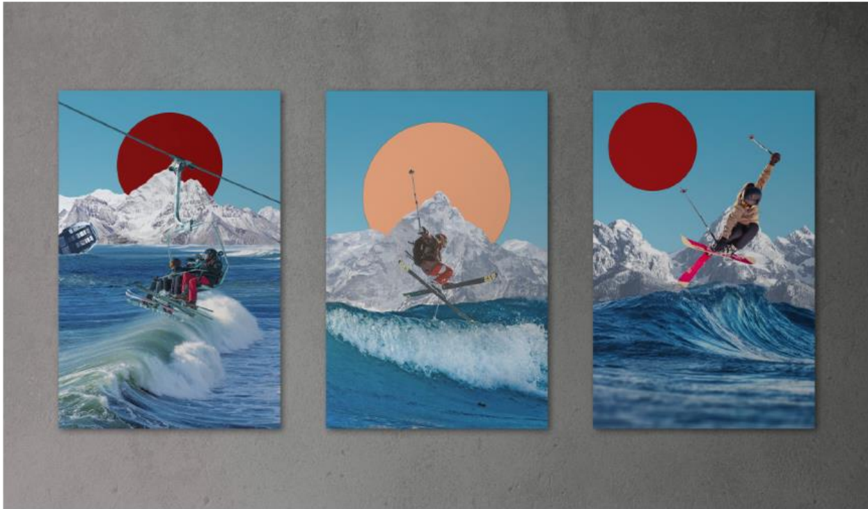
Figure 4: Surfing the Slopes Poster Series