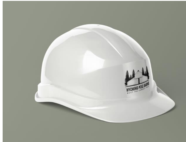
Figure 6: Wyoming Pole Barns Logo Design

WPB WYOMING POLE BARN BUILT THE COWBOY WAY