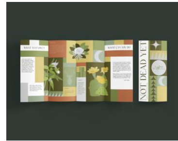
Figure 1: Collection: Wilted and Withered Exhibition Design