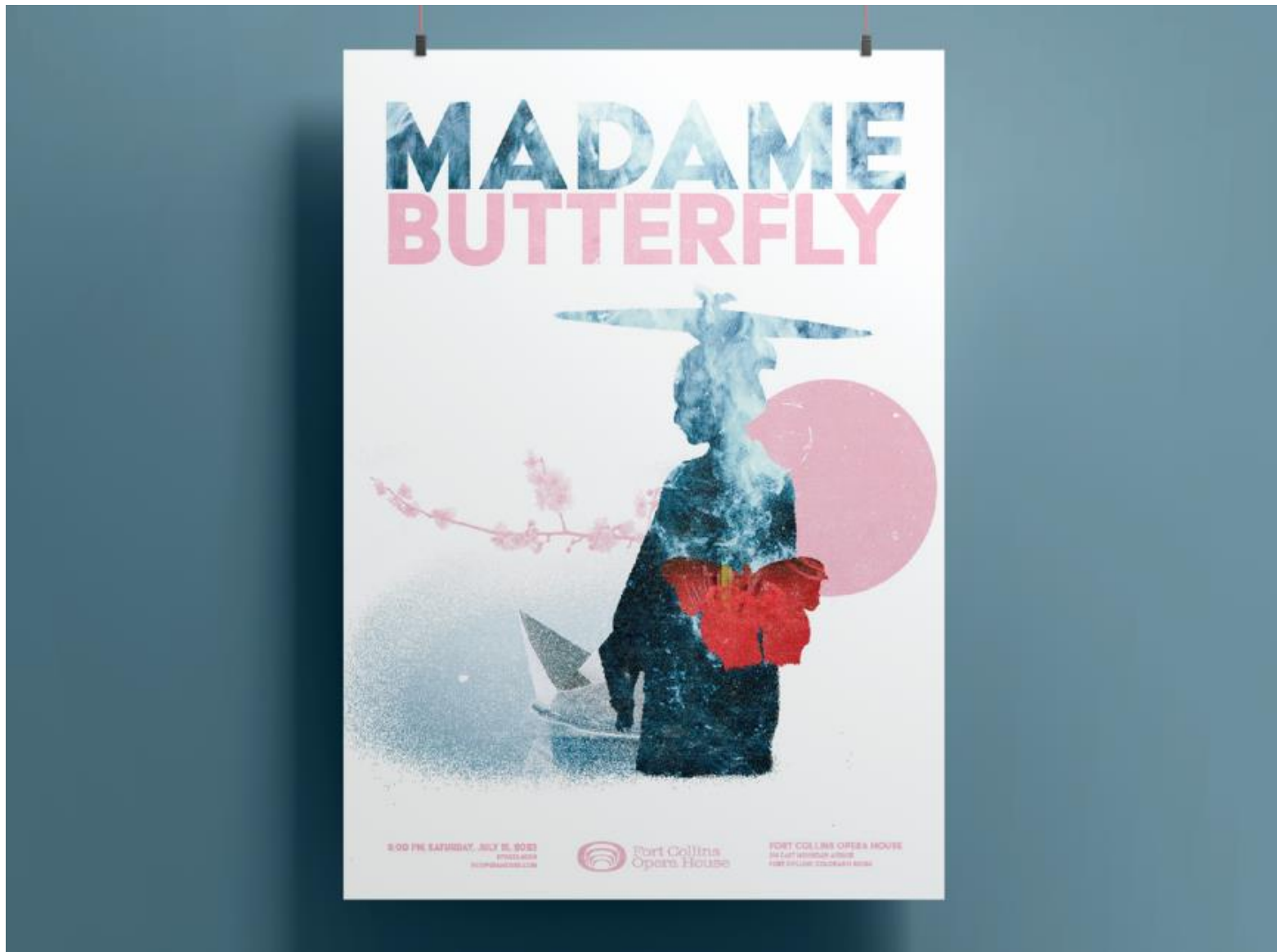
Figure 2: Madame Butterfly Poster