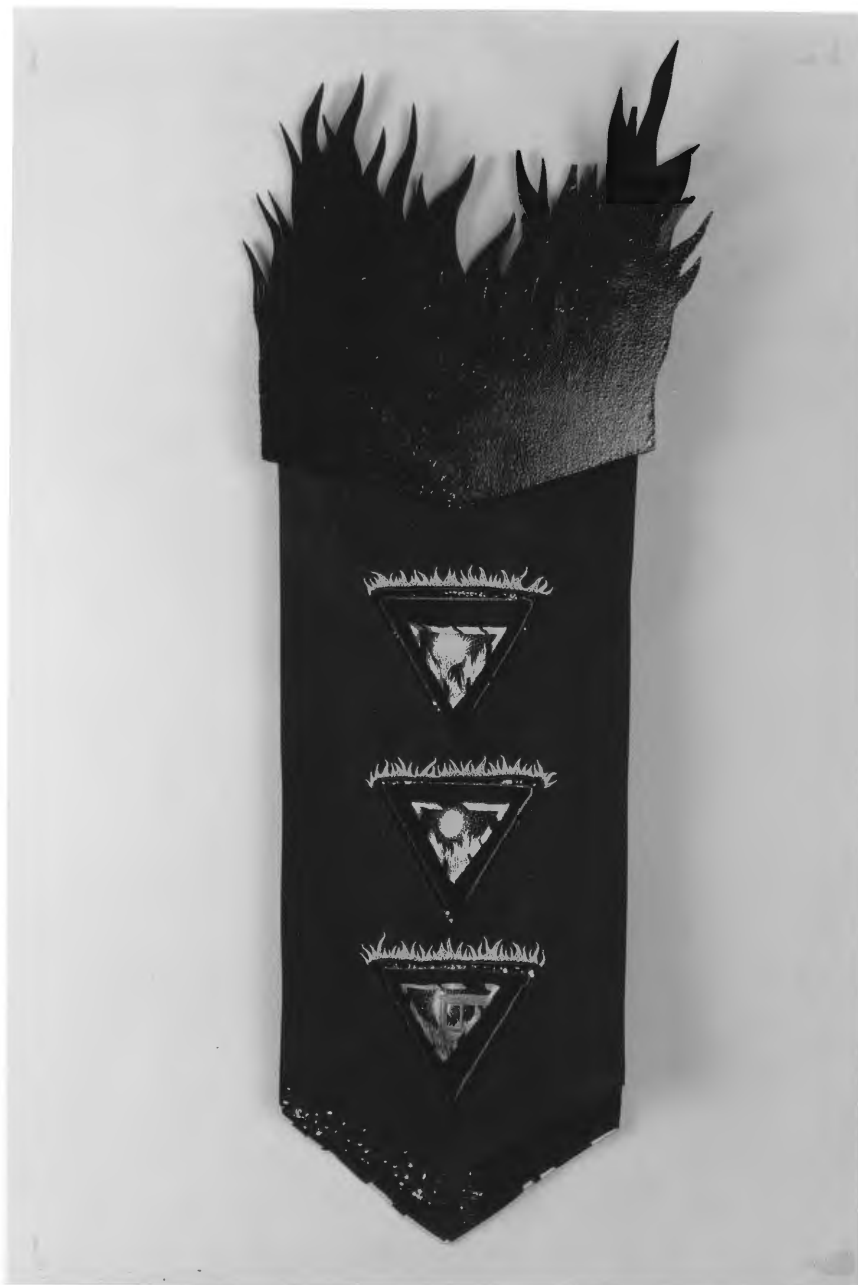
Figure 1. "Fire Crown," fabric, wood, thread, sequins, 48" x 17.5" x 2.5"