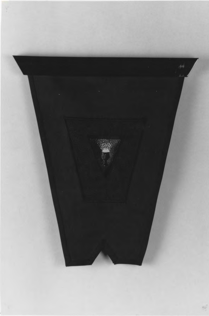
Figure 2. "Glowing Vessel," fabric, wood, thread, 18.5" x 16" x 1.24"