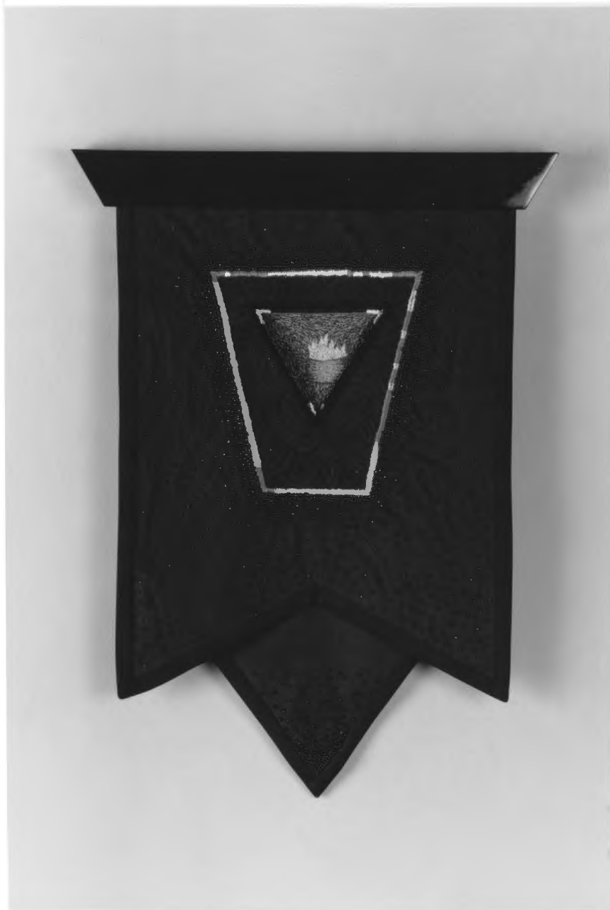
Figure 6. "Contained Fire/ Spilled Beads," fabric, wood, thread, beads, 19 x 14.5 x 1.25