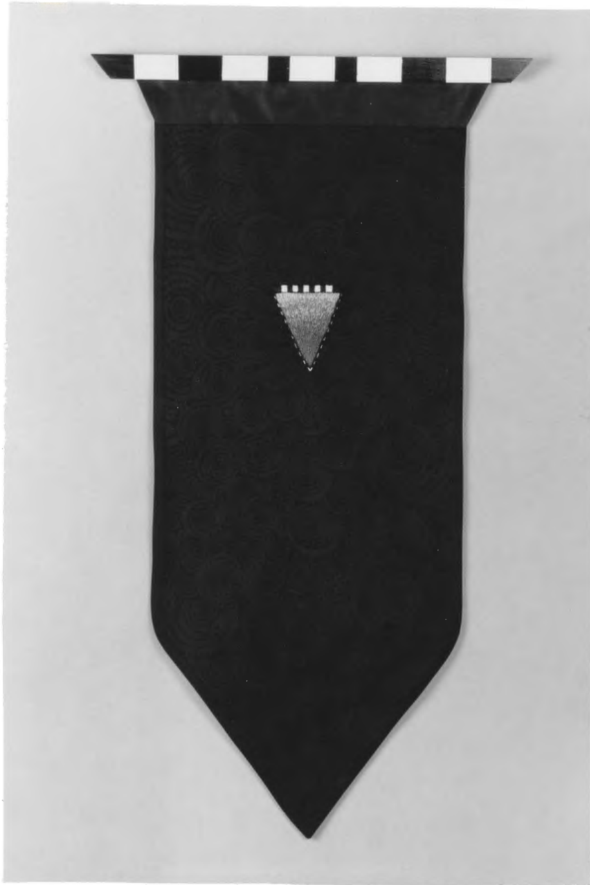
Figure 8. "Nebraska Fire Train," fabric, wood, thread, 35.5" x 19.5"