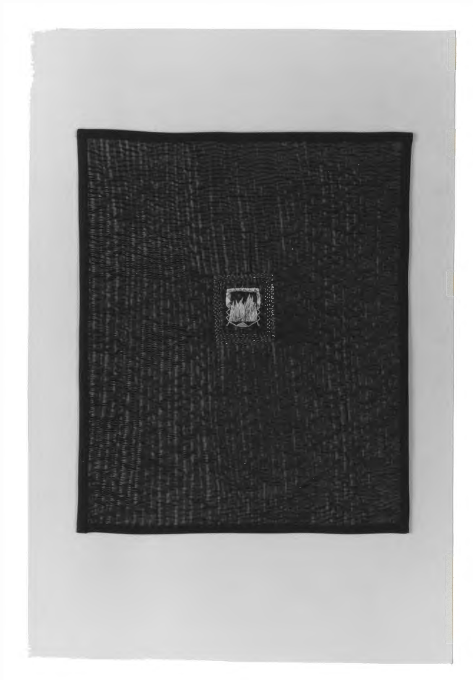
Figure 10. "Quilted Beginning," fabric, thread, 19" x 16"