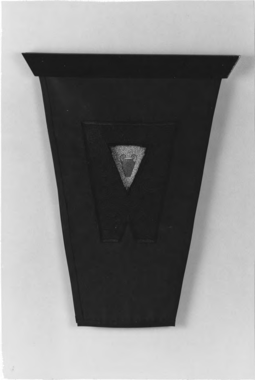
Figure 4. "The First Half of the Zeigfield Follies, Starring Dr. Seuss," fabric, wood, thread, 20.5" x 16" x 1.25"