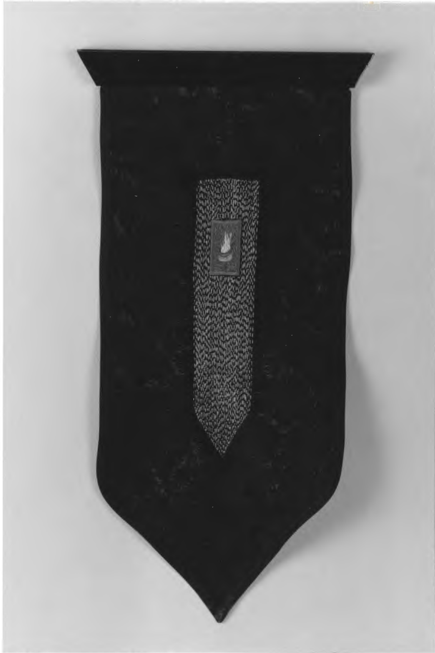
Figure 7. "Handmade Fire," fabric, wood, thread, 29" x 12.5" x 1.25"