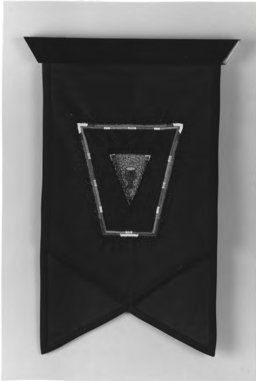
Figure 5. "Traveled Vessel," fabric, wood, thread, beads, 21.5 x 14.5" x 1.25"