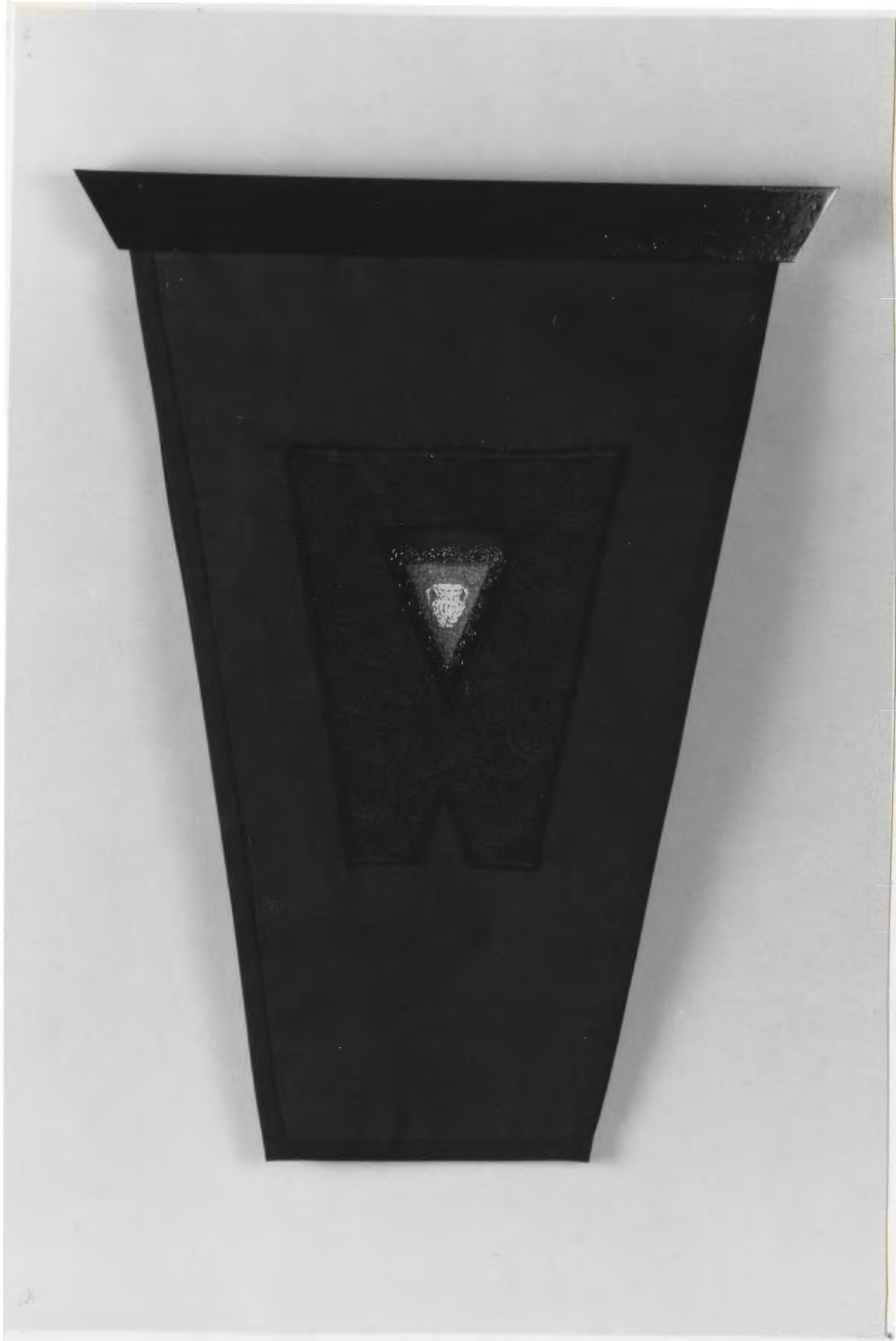
Figure 3. "Blurred Clarity," fabric, wood, thread, 21" x 16" x 1.25"