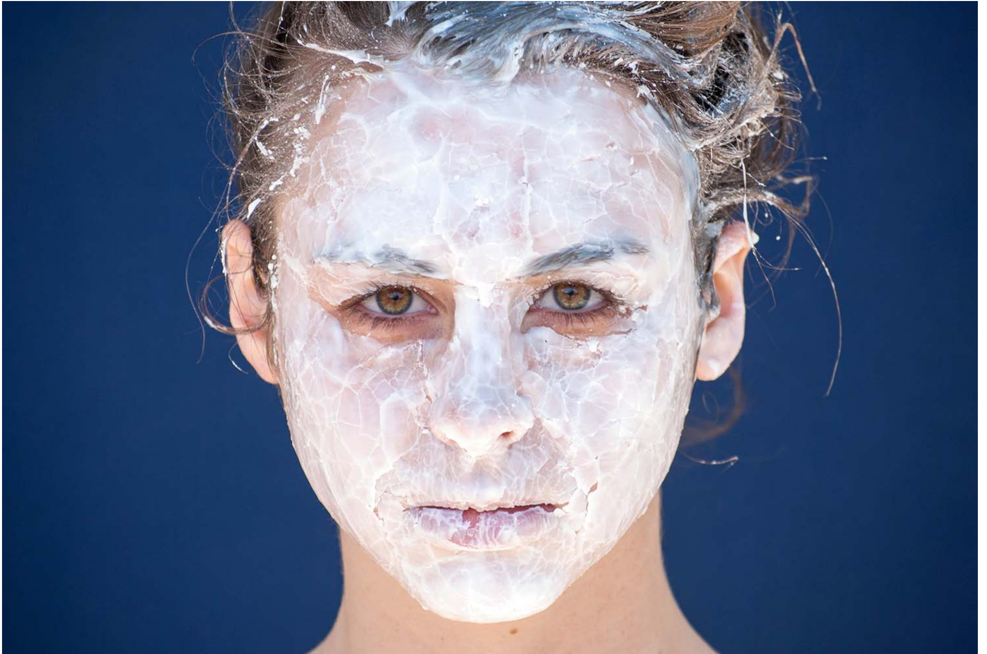
Figure 7: Wax.