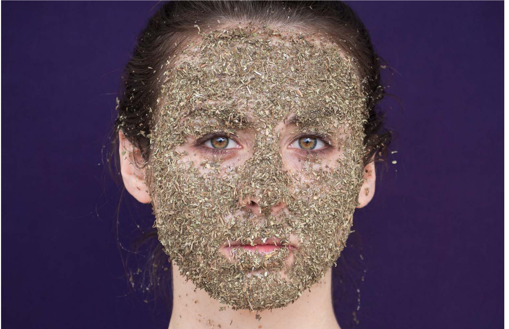
Figure 8: Herbs.