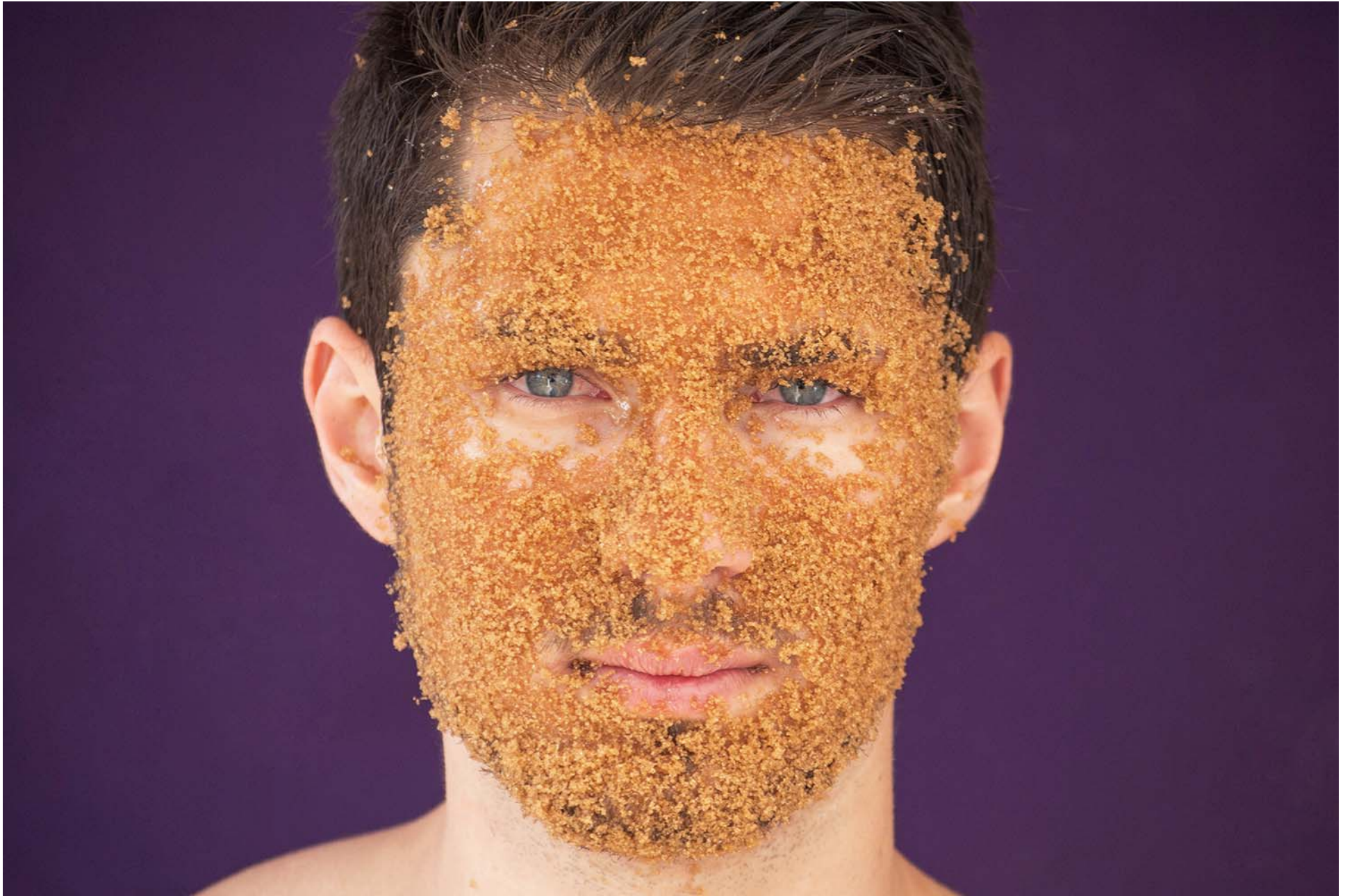
Figure 14: Brown Sugar.