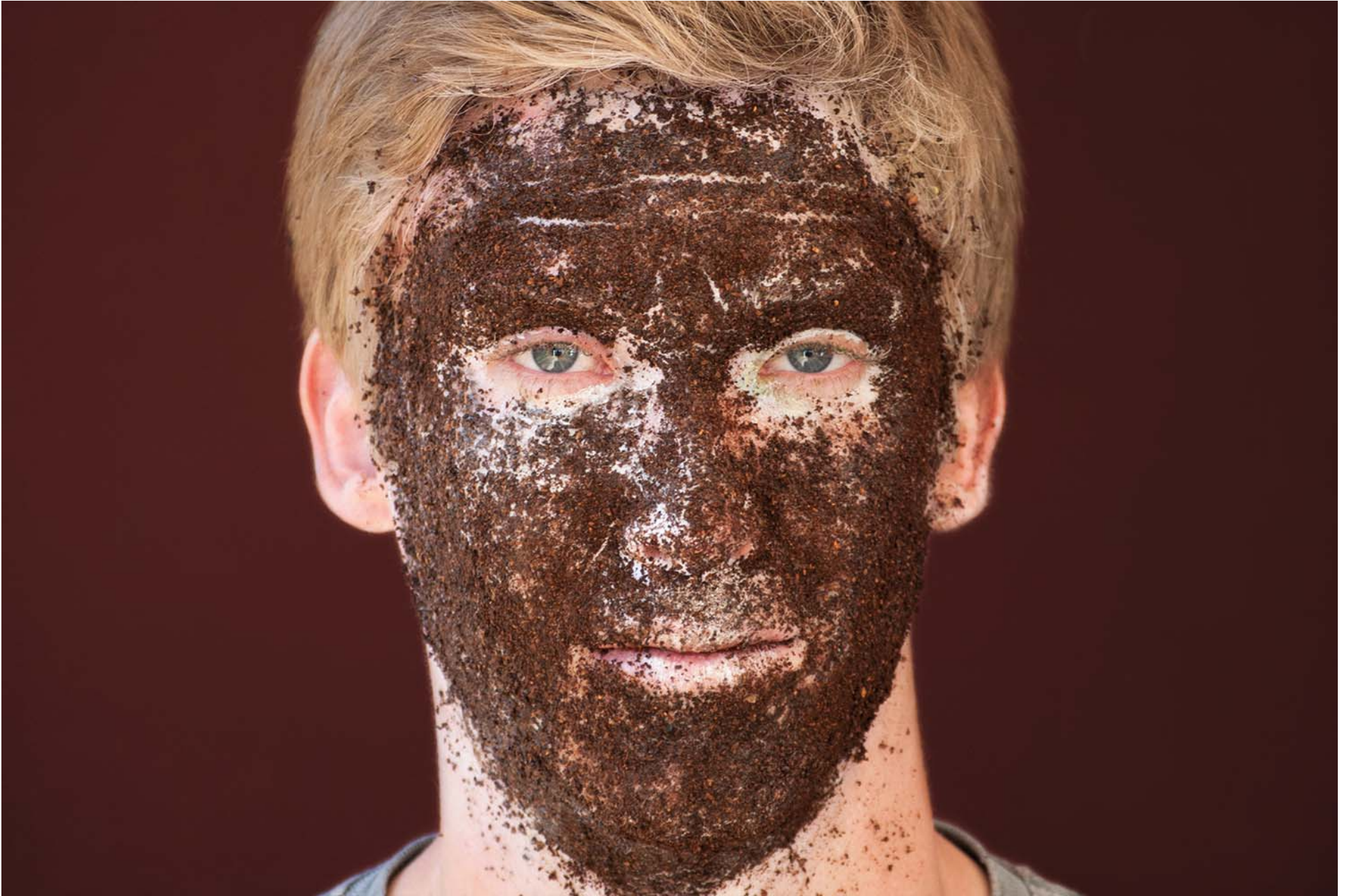
Figure 11: Coffee.