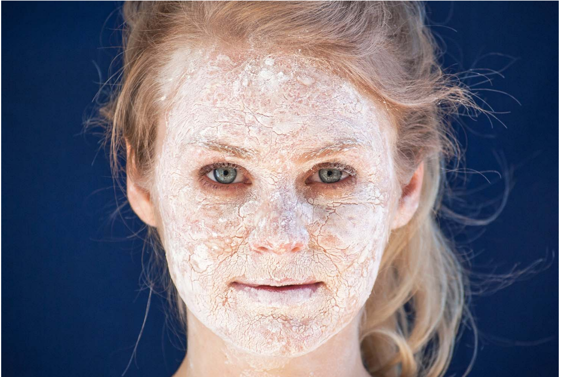
Figure 9: Paste.