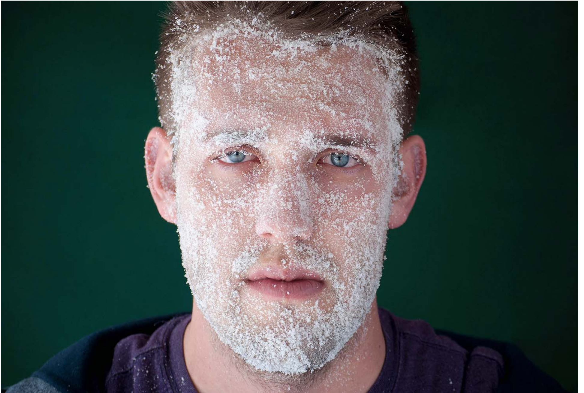
Figure 4: Sugar.