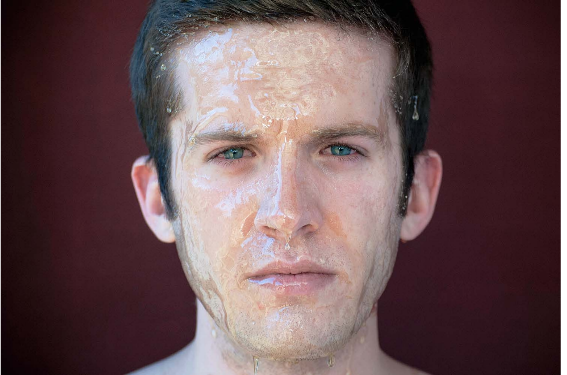
Figure 1: Honey.