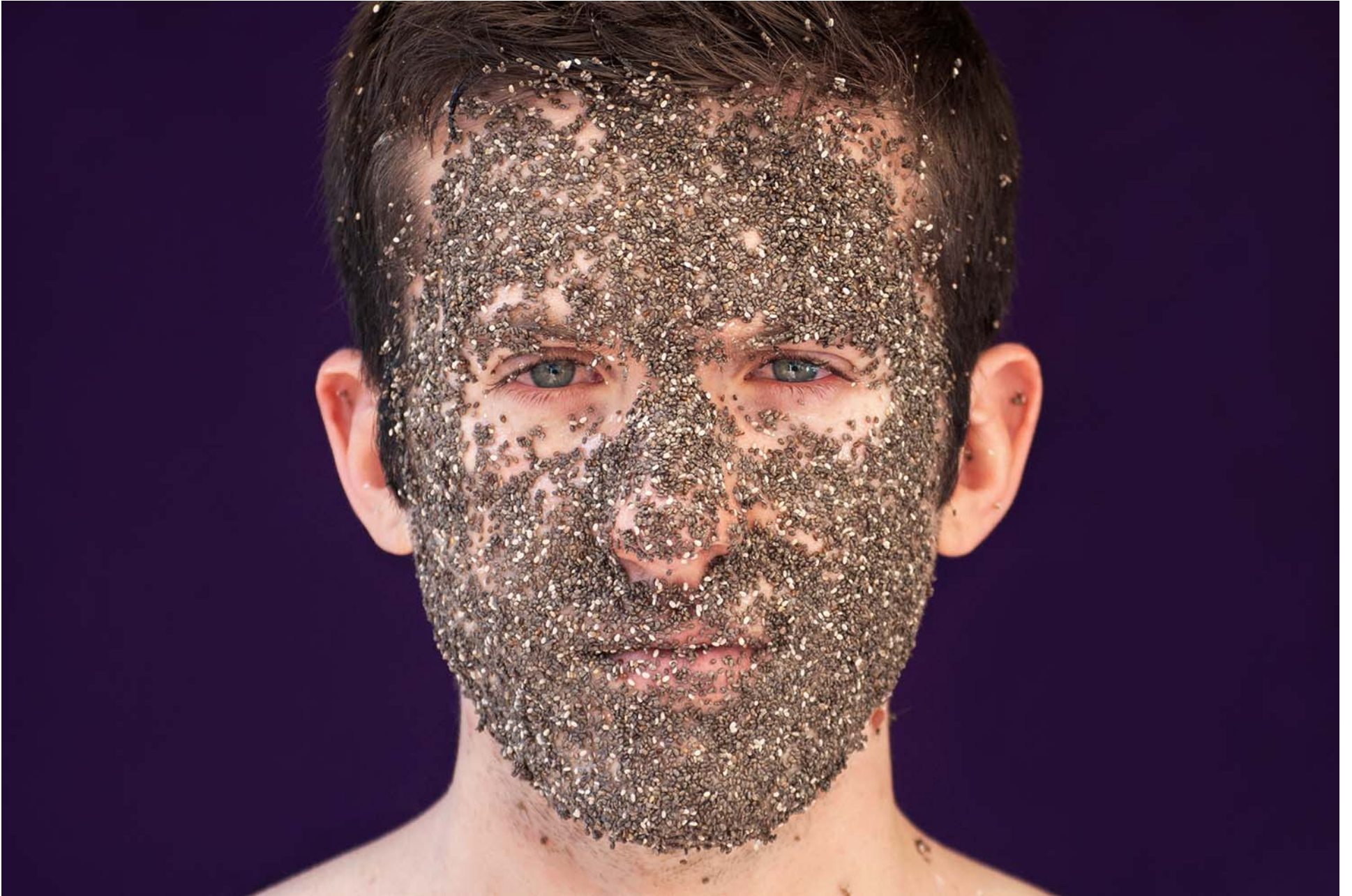
Figure 2: Chia Seeds.