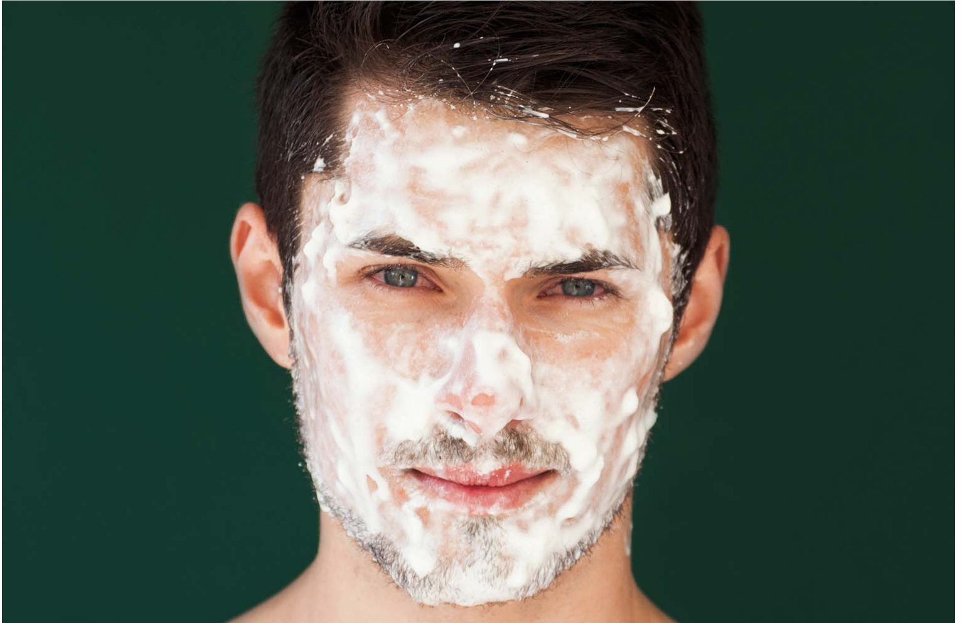
Figure 13: Foam.