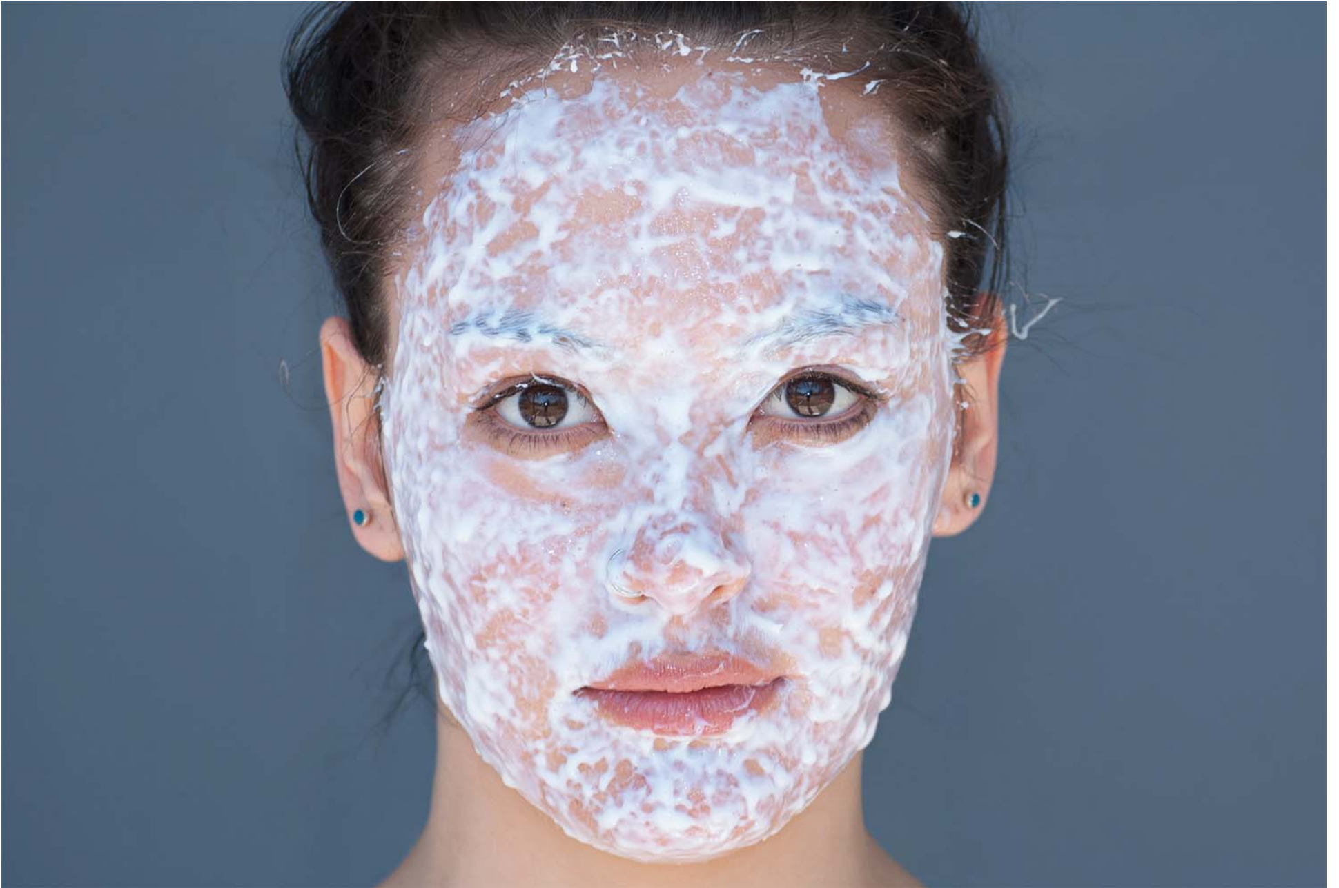
Figure 16: Glue.