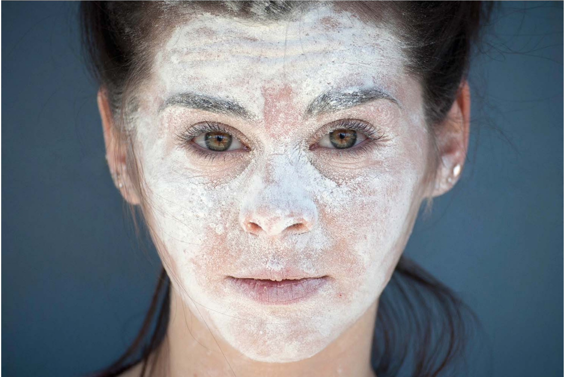
Figure 5: Flour.