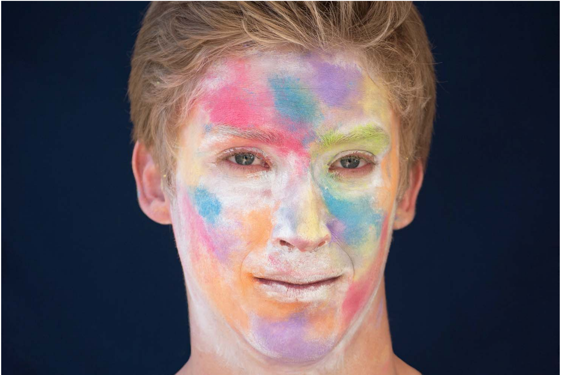
Figure 12: Chalk.