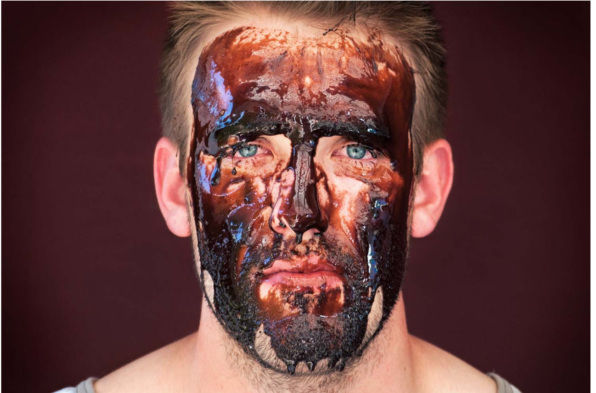
Figure 3: Chocolate.