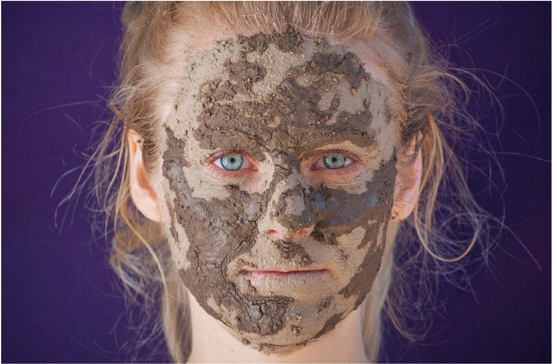
Figure 10: Mud.