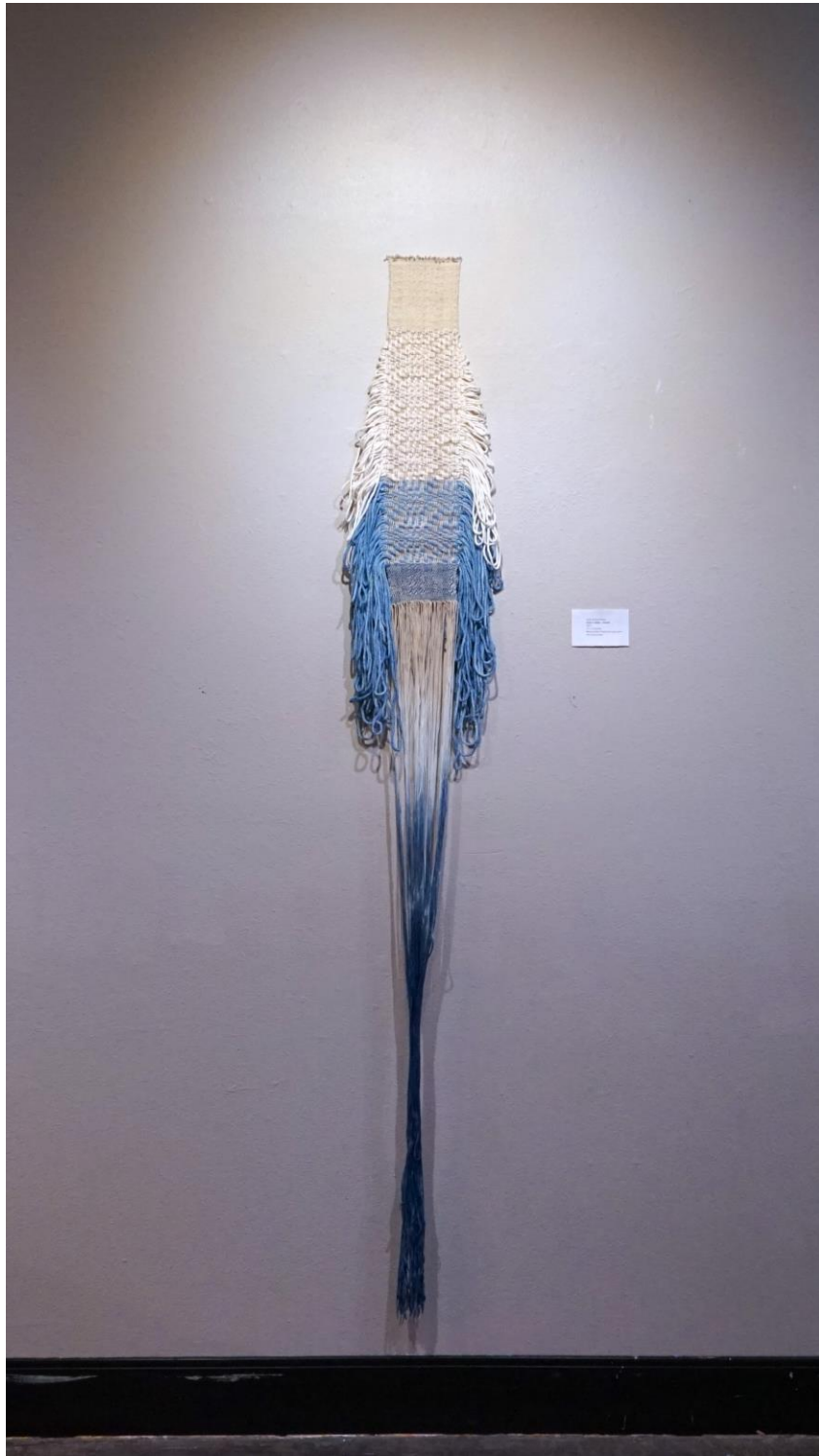
Figure 2: A Dip in Indigo – Unravel