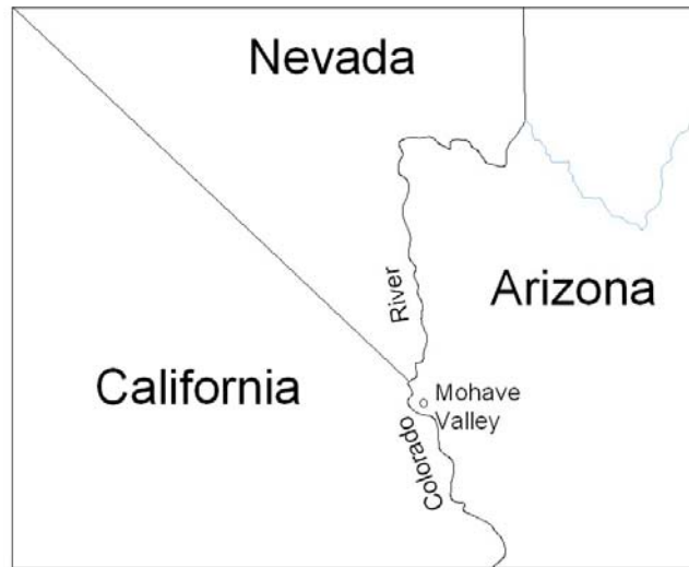
Figure 1. Mohave Valley site map

Mohave Valley Irrigation and Drainage District is located in western Arizona along the east side of Colorado River a few miles south of the southern tip of Nevada. All MVIDD waters are pumped from the aquifer fed by the Colorado River. Pumped MVIDD flows are administered as diversions from the Colorado River. By virtue of an agreement dated November 14, 1968 between MVIDD and the US Bureau of Reclamation, MVIDD holds entitlement for use of 41,000 acre feet of Colorado River Water annually. Figure 1 is a site map of the district.