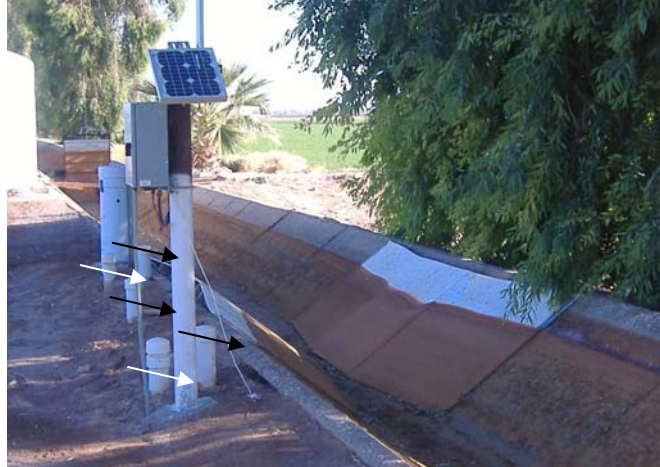
Figure 5. Venturi solution long-throated flume at MVIDD 18 & 19

The two stilling wells for measuring water levels in the flume approach and throat sections may be seen at the left of the flume in Figure 5 (white arrows). Standpipes for accessing valves in the pipes connecting the stilling wells to each other and to the canal taps are also shown (black arrows). The venturi solution methodology produces valid flow measurement rates for submergence rates within the flume's modular limit for critical-flow operation as well as for excessive submergence conditions. The venturi solution flumes installed at MVIDD were designed to create a small increase in upstream canal level to minimize problems associated with limited canal freeboard. The result of limiting the upstream stage increase will be high submergence operating conditions that exceed the flume's critical-flow modular limits.