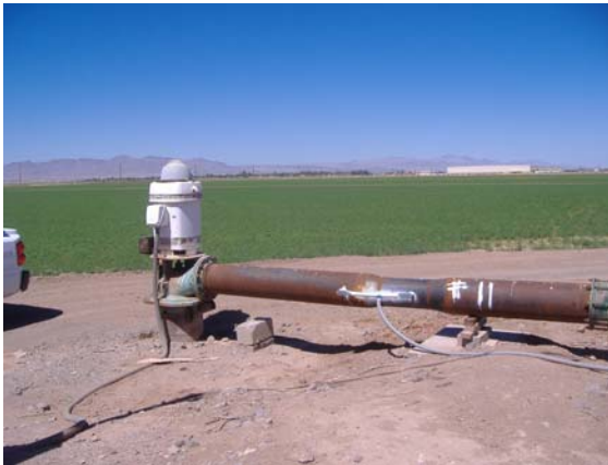
Figure 6. Pipe venturi at MVIDD 11

Figure 6 shows a pipe fitting venturi meter at an MVIDD well with an elevated discharge pipe. The installation shown in Figure 7 is at a well with a discharge pipe at the ground surface.