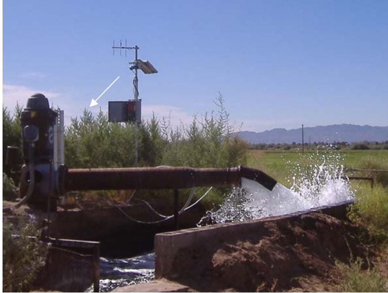
Figure 9. Double manometer calibration apparatus (arrow) set up at MVIDD well 20