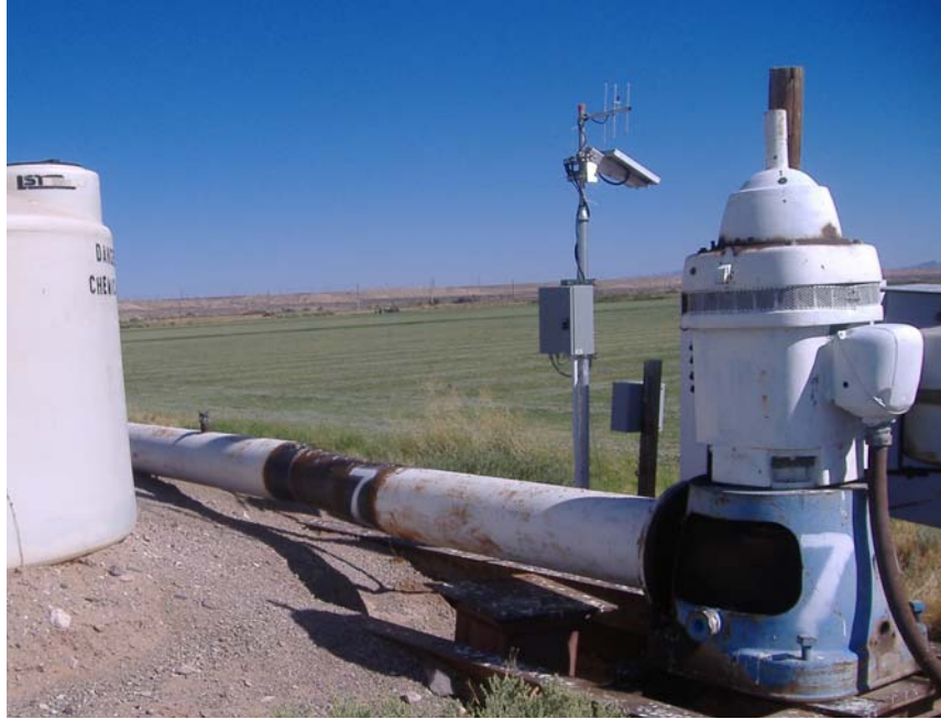
Figure 11. Poorly aligned pipe fitting meter at MVIDD Well 7

Accurate knowledge of the cross sectional flow area at the upstream and throat tap locations is key information need for measuring flow using a venturi meter. As noted above, information provided by the contractors regarding pipe materials utilized for venturi installations was limited. For sites where better information was not available, outside pipe circumferences were measured for each tap location. Using the measured circumferences, pipe OD dimensions were calculated and compared against standard pipe dimension tables to identify the “likely” pipe type and ID dimension. Cross section flow areas were then calculated using the presumed ID dimensions.