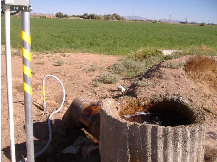
Figure 8. Underground venturi at MVIDD 29

For the well measurement demonstration field test site shown in Figure 2, a simple manometer system consisting of two lengths of \frac{3}{8} inch ID clear vinyl tubing each attached to a venturi pressure tap was assembled in the field to calibrate sensor offsets. Heights of the respective water columns were measured from an arbitrary datum. With this simple manometer apparatus, a small but constant fluctuation in water level was observed in water columns in each manometer. Water column values recorded for the calibration were the average of the observed high and low levels.