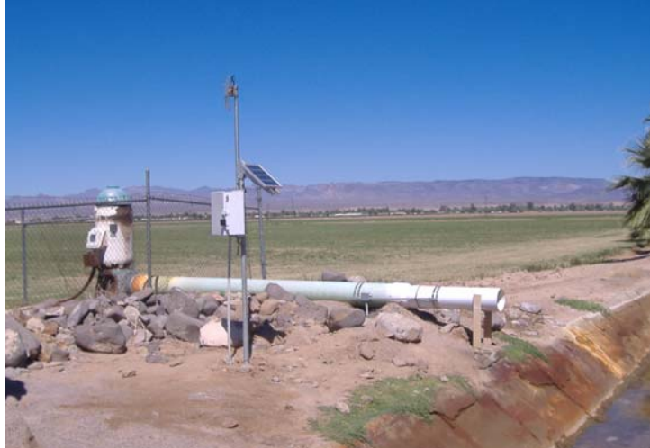
Figure 2. Pipe flow measurement field test site at MVIDD well 23

The pole-mounted electrical enclosure (Figure 2) houses the bubbler sensor/solenoid valve system, along with the RTU which is programmed to operate the bubbler and valves. Flow measurement data is logged onsite. A base unit at the MVIDD office can be operated to periodically poll data from field sites and write to a data file on the hard drive of a PC linked to the base unit. Bubbler lines are routed from the enclosure through a pipe conduit to tap locations on the pump discharge line. A temporary manometer system was set up to calibrate sensor offsets for each bubbler tap location.