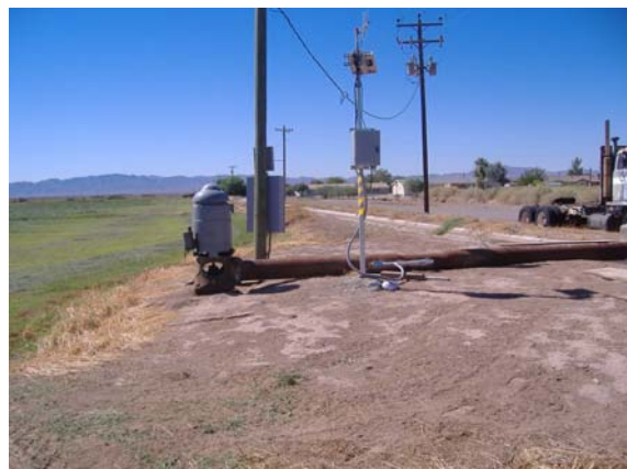
Figure 7. Pipe venturi at MVIDD 15

At MVIDD site 29 (shown in Figure 8) a pipe fitting venturi was installed on an underground pipeline. Lines connected to the venturi pressure taps were installed prior to backfill, however venturi meter was buried before sensor offset calibration was performed. In Figure 8 the pipe “daylights” just downstream of the buried venturi. Flow is seen discharging into a vertical “riser” section of concrete pipe.