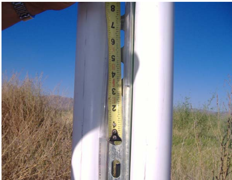
Figure 10. Close-up view of the double manometer apparatus

As a calibration is performed, the bubbler system is initially turned off. Poly tubes are installed linking a manometer stilling well to each venturi tap. The manometer linked to the upstream tap is allowed to fill from the tap. For the low pressure throat tap, water is poured into the top of the stilling well and the well is filled to a level higher than the manometer connection at the throat tap. The throat manometer is then allowed to draw down to a level representing a pressure in equilibrium with the tap. Once both manometers reach static condition, water column levels are read. The base of the metal rail to which both stilling wells are attached serves as a convenient arbitrary datum for measurement of each water column. After water column data has been recorded, the