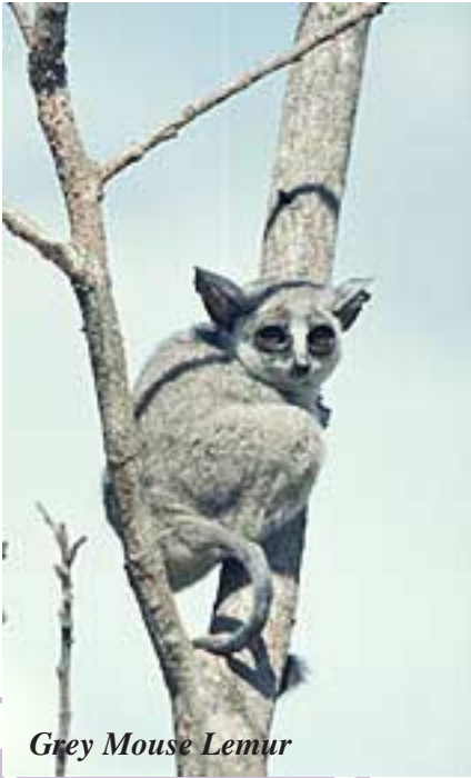
Grey Mouse Lemur