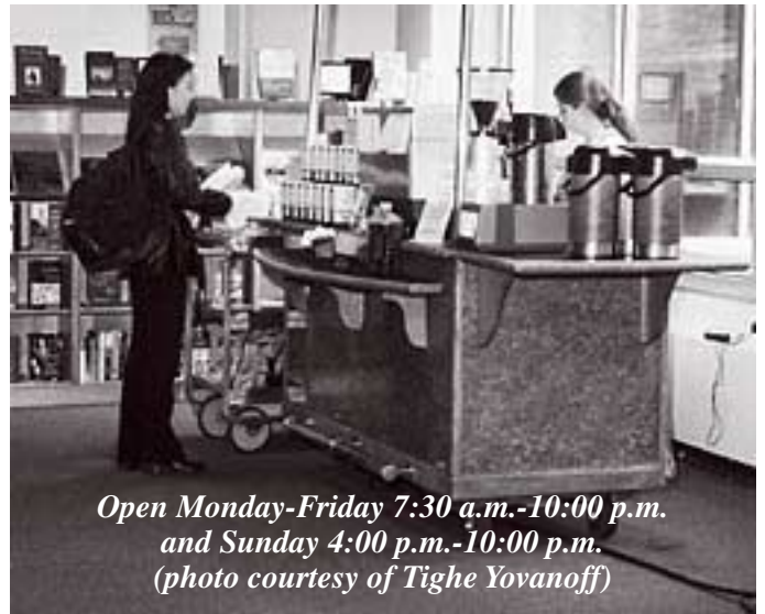
Open Monday-Friday 7:30 a.m.-10:00 p.m. and Sunday 4:00 p.m.-10:00 p.m.

The University funded this exciting project in recognition of the Library's goal to build collections that reflect emerging curricular and research needs. Subject librarians will contact new faculty to identify specific materials for the Library to purchase. For a list of Library subject specialists please see the Library's website ( http://lib.colostate.edu/reference/sublibs.shtml ).