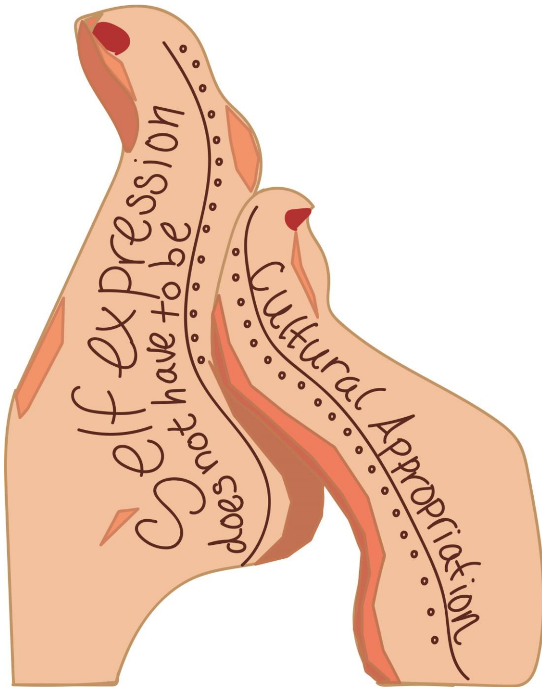
Figure 2: Self Expression 1