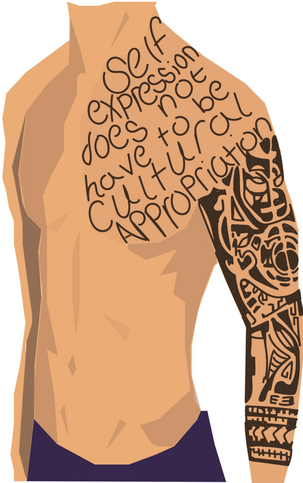
Figure 3: Self Expression 2