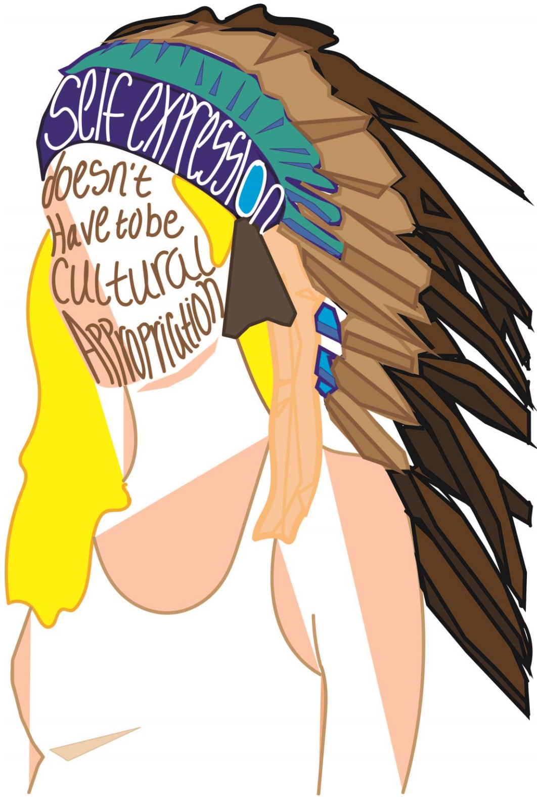
Figure 4: Self Expression 3