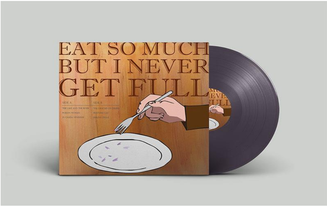
Figure 10: The Dear Hunter (back)