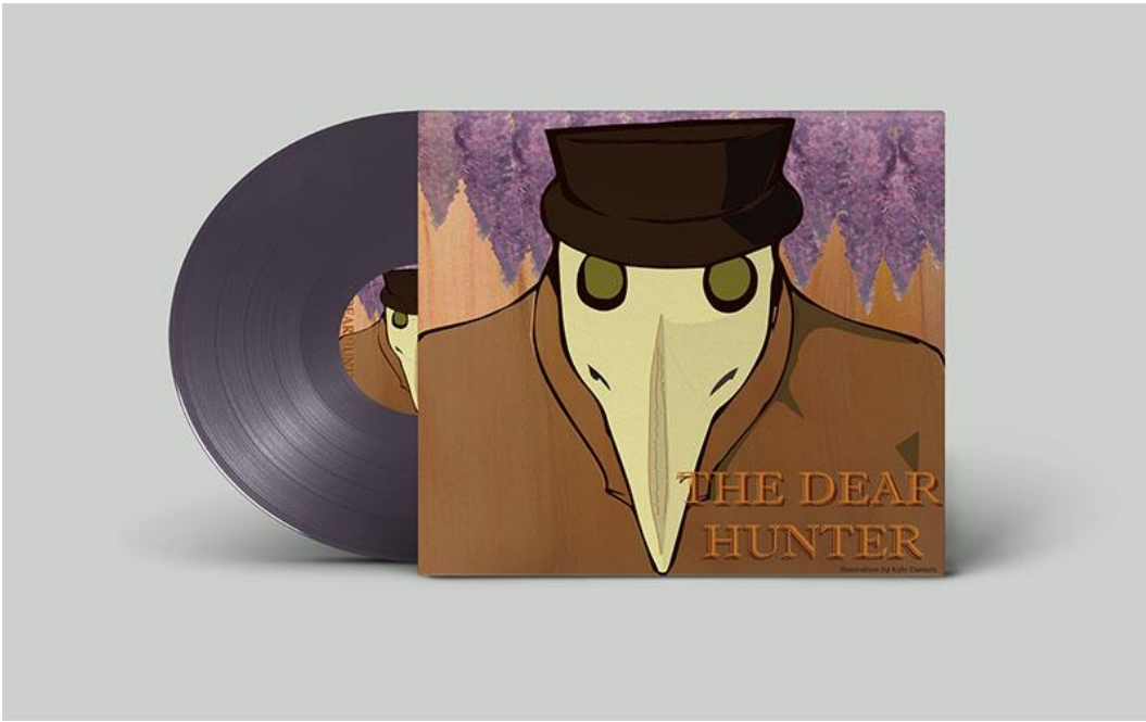
Figure 9: The Dear Hunter (front)