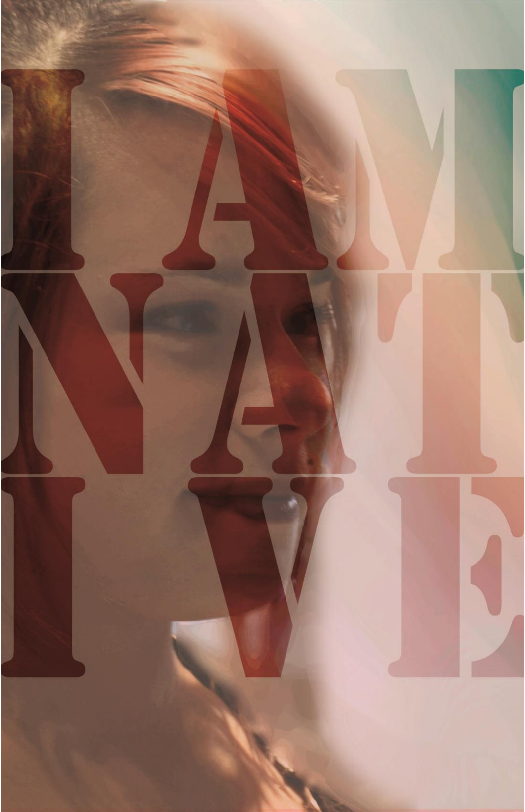
Figure 6: I Am Native