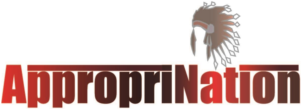
Figure 1: Appropriation