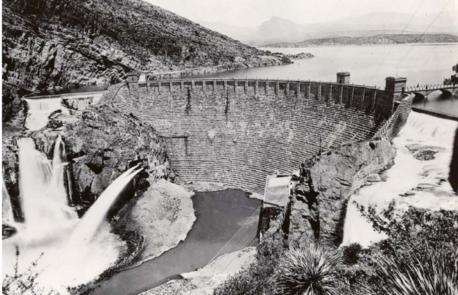
Image 3. Roosevelt Dam spilling.

continuous irrigation, portions of the Valley soon experienced water logging from the rising groundwater table. The Association amended its Articles of Incorporation in 1919 and embarked on a program of constructing over 300 miles of drains and installing pumping plants. 5