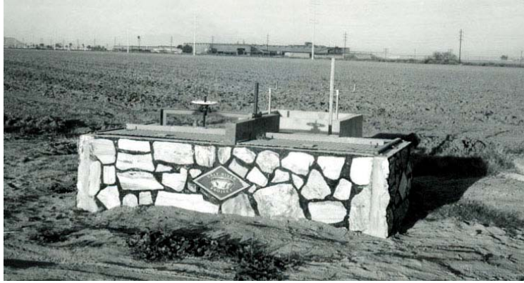
Image 9. Community styling irrigation structure.

These structures had the appearance of blending into the surrounding area. When SRP needed to replace an irrigation turnout, employees installed one of the new community designed structures, attempting to make it “fit into a neighborhood” with its shape and pattern. Plans could call for flagstone, brickwork, redwood veneer or new types of precast designs. As new subdivisions or commercial enterprises took over farm land, SRP worked with the developers and supplied the builders with specifications and plans for the new structures. 12 Road and building construction required most of the laterals and ditches to be relocated and piped (see Image 10).