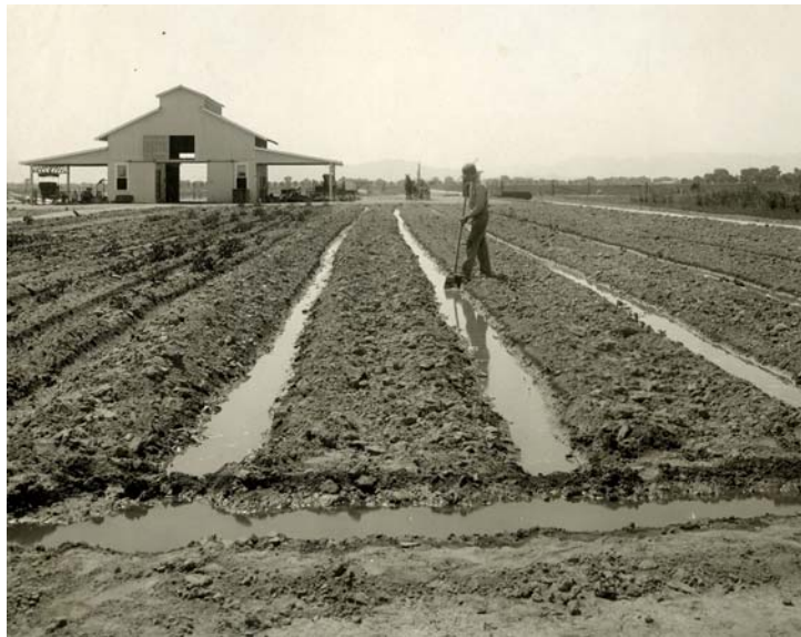
Image 5. Irrigating the fields.

While the depression of the 1930s was more moderate in the Valley than other parts of the nation, farm prices did drop and the Arizona copper industry was at one of its lowest points. For the Salt River Project, this meant shareholders had difficulty paying assessments and power revenues were reduced. Farmers irrigated almost half the acreage in alfalfa, grain or pasturage with a total number of acres being cropped within the Salt River Project reaching 208,546. By the middle of the decade, farmers were irrigating more than 228,000 acres, not including fallow, urban irrigation or water to townsite lands (see Image 5). Prices also had risen on almost all the crops being grown. 7