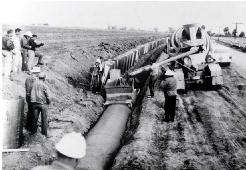
Image 10. Cast in place pipe being manufactured as open laterals are placed underground.

These structures had the appearance of blending into the surrounding area. When SRP needed to replace an irrigation turnout, employees installed one of the new community designed structures, attempting to make it “fit into a neighborhood” with its shape and pattern. Plans could call for flagstone, brickwork, redwood veneer or new types of precast designs. As new subdivisions or commercial enterprises took over farm land, SRP worked with the developers and supplied the builders with specifications and plans for the new structures. 12 Road and building construction required most of the laterals and ditches to be relocated and piped (see Image 10).