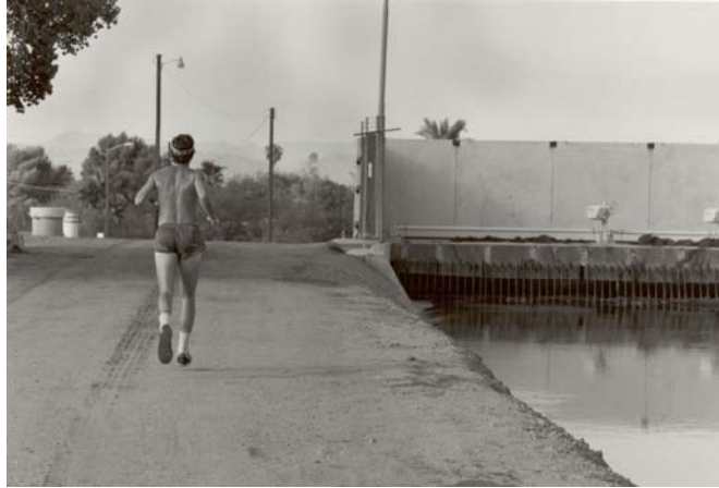
Image 11. Jogging along a SRP canal.

In the mid-1960s, SRP changed its view of the irrigation system as only a means to deliver water. As the urban area increased in proximity to SRP's canals and laterals, the need to provide for recreational and multi-use activities along the canals became more apparent. The Project cooperated with the local Valley Beautiful committee by planting trees and landscaping along the banks of the waterways. With encouragement from local communities, neighborhoods, and cities, SRP and the Bureau of Reclamation signed agreements that would permit the use of canal and lateral rights of way for parks and trails, but swimming was still not allowed (see Image 11). Employees trimmed trees and removed weeds along the banks of the canals, laterals and ditches.