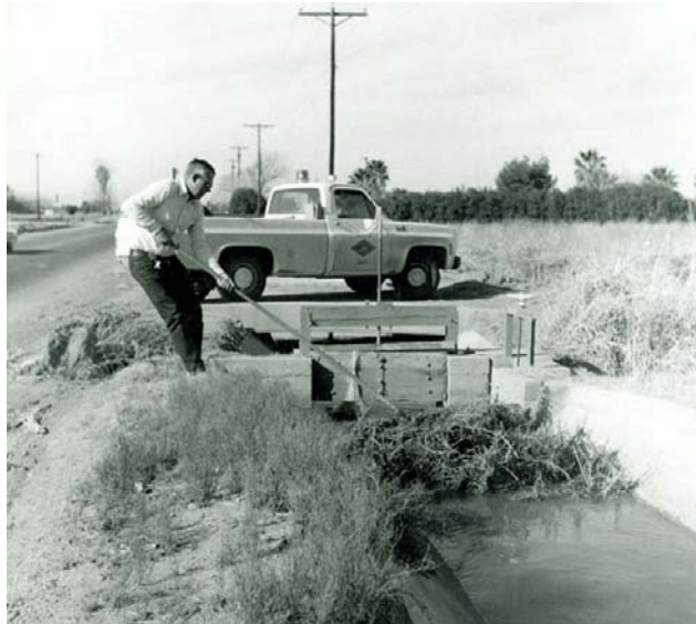
Image 7. SRP employee cleaning a lateral.

Although agricultural land slowly was becoming residential subdivisions and shopping centers, SRP still needed to maintain its irrigations in an evolving urban setting. Because of the lack of workers and materials, minimal improvements were made to the irrigation system in the 1940s. In 1949, the U.S. Congress passed legislation, the Rehabilitation and Betterment Act, which loaned funds to federal reclamation projects to improve both power and water infrastructure. During the first fifty years of the Salt River Project, the design of the irrigation distribution system focused on delivering water with little seepage loss and limited expense; losses of water in unlined dirt ditches were unwanted, but the cost to line them with concrete was prohibitive for the Association. The turnout structures were meant to be functional, not beautiful. That attitude changed after the war. Long time residents frowned at the unsightly turn-out structures which stood above-ground in their neighborhoods, but they realized the necessity for the delivery of subdivision and irrigation water in the area (see Image 7). The newer citizens were unaware of the connection of the water, distribution system and their land.