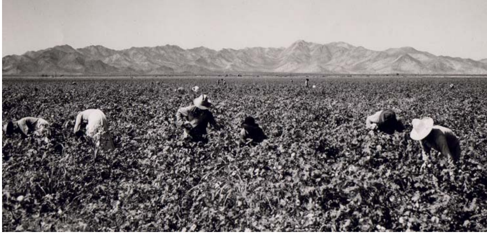
Image 4. Cotton picking in the Salt River Valley.

While the depression of the 1930s was more moderate in the Valley than other parts of the nation, farm prices did drop and the Arizona copper industry was at one of its lowest points. For the Salt River Project, this meant shareholders had difficulty paying assessments and power revenues were reduced. Farmers irrigated almost half the acreage in alfalfa, grain or pasturage with a total number of acres being cropped within the Salt River Project reaching 208,546. By the middle of the decade, farmers were irrigating more than 228,000 acres, not including fallow, urban irrigation or water to townsite lands (see Image 5). Prices also had risen on almost all the crops being grown. 7