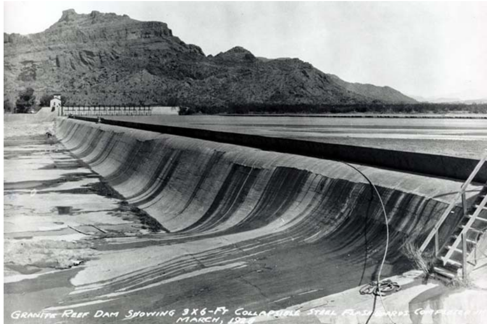
Image 2. Granite Reef Diversion Dam.

The drought that started in 1898 ended in 1905 following a torrential down pour that sent water rushing down the Salt River, delaying construction of Roosevelt Dam and washing out all the small diversion dams in the Valley. Local farmers approached the U.S. Reclamation Service engineers for assistance. The government purchased the northside canals in April 1906, paying over $300,000 for the Arizona, Grand, Maricopa, Salt River Valley and Crosscut canals. The federal engineers also constructed Granite Reef Diversion Dam (see Image 2) which diverted water to both sides of the river.