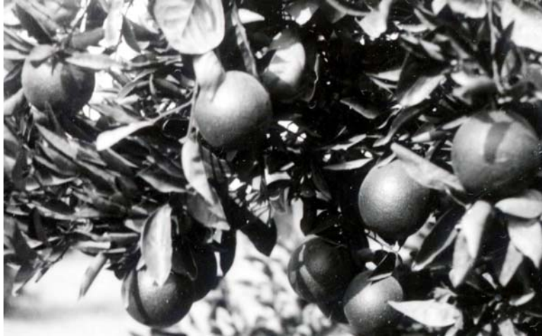
Image 1. Oranges grown in the Arizona sun.

harvest, since the fruit ripened before the California orchards (see Image 1). Exotic fruits were grown beyond the staple crops of grain, cotton and alfalfa. At the beginning of the new century, the U.S. Census tallied over 20,000 people within Maricopa County and the acreage farmed within the Valley totaled more than 130,000.