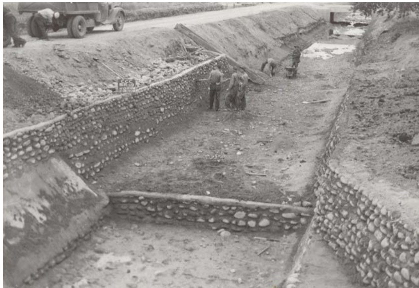
Image 6. CCC work done on SRP lateral in 1938.

Utilizing the services of this federal agency, the Association had the men construct headgates, line canals, and help repair damages to the irrigation structures throughout the Project. The CCC crews repaired the canals on both sides of the river when floods broke through the irrigation structures. Operation and maintenance of the SRP irrigation system was reaching a critical point in 1938. A large number of ditch structures had been constructed of redwood lumber during the early years of the Project and these features were reaching their end of useful life when CCC crews replaced practically all these structures with concrete (see Image 6). The CCC also worked on modifying the ditch and lateral capacities due to the increase in specialty crops, such as lettuce, concentrated in particular areas. The original lateral system was designed for diversified cropping, which permitted delivery of water through a normal rotation. The special crops often required simultaneous demands for water service within the same contiguous areas. 8 The CCC work on the Project was discontinued because of the trade union complaints charging the corps members were doing the skilled work of the union laborers. Before its departure, the CCC completed over 700 projects at SRP.