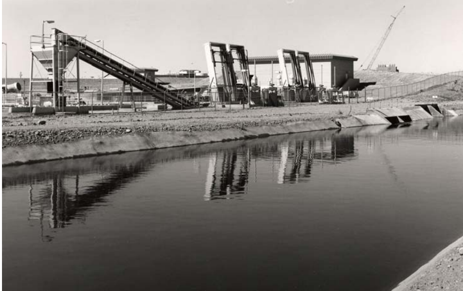
Image 8. Val Vista Water Treatment Plant, South Canal.

The domestic water agreement also opened the way for SRP water to be delivered to cities through canals, and the first Phoenix canal water treatment plant opened on the Arizona Canal in 1952. The contract increased the supply available to cities, and it provided the Salt River Project with a way to manage the urbanization of its area by providing water to the new residents who were coming to live on the former farmlands. Furthermore, the contract became a model for other agreements with local municipalities. In time, the cities of Scottsdale, Tempe, Mesa, Chandler, Gilbert, and Peoria all signed similar domestic water contracts.