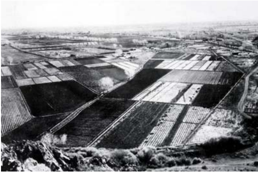
Tempe irrigated fields, 1903

SRP continues to deliver water to the residents of the Valley. Over the past one hundred years, SRP provided a stable water supply for crops, transforming the desert to the farmlands, and now farmlands to the development of cities businesses and communities; developing power, to operate the irrigation pumps, light the homes, and now power our industries.