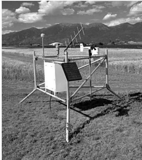
Figure 2. Typical AgriMet Weather Station

The data logger at the site monitors each of the sensors once every second. These readings are used to derive the final data parameters for subsequent transmission, such as 15 minute air temperature observations, total hourly precipitation, etc. These parameters are transmitted from the weather stations via the GOES satellite