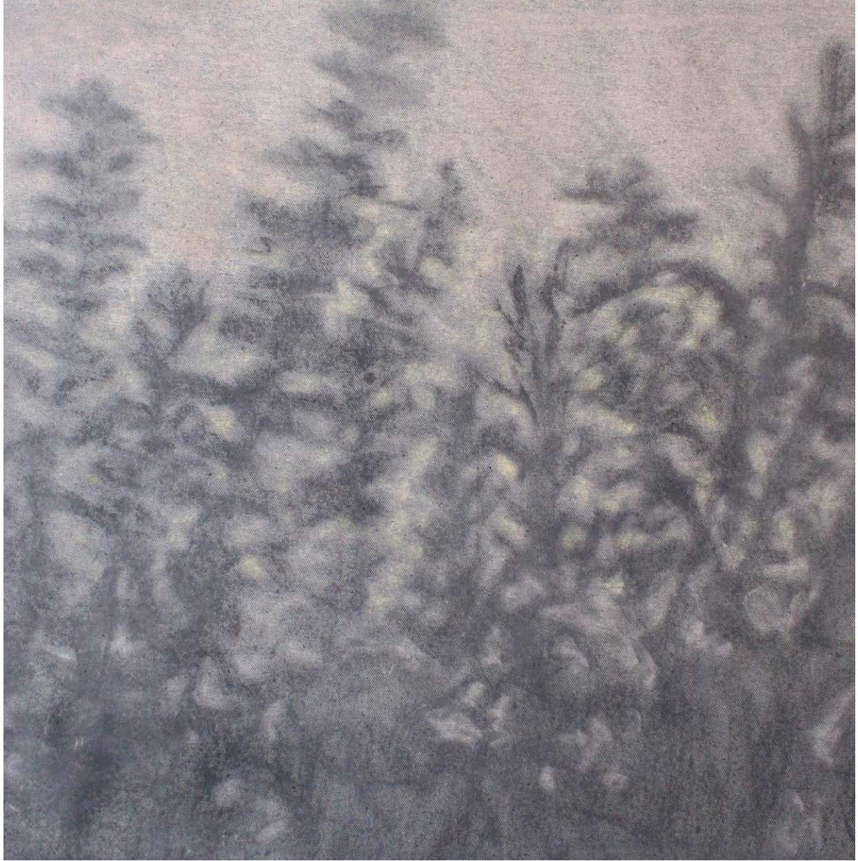
Figure 4: Floralescence #1