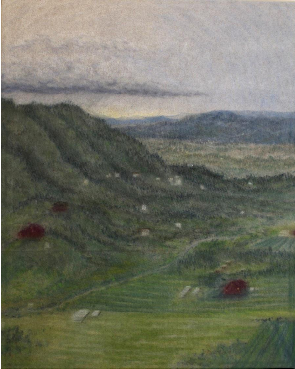
Figure 7: Radiant Gray