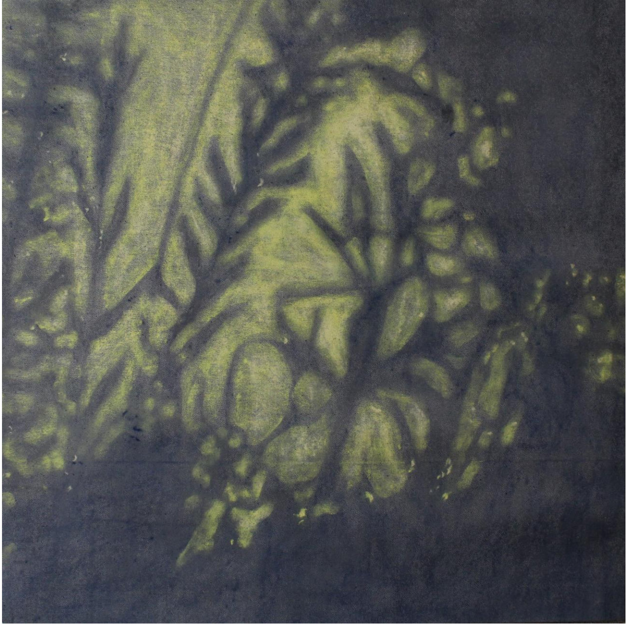
Figure 4: Floralescence #2