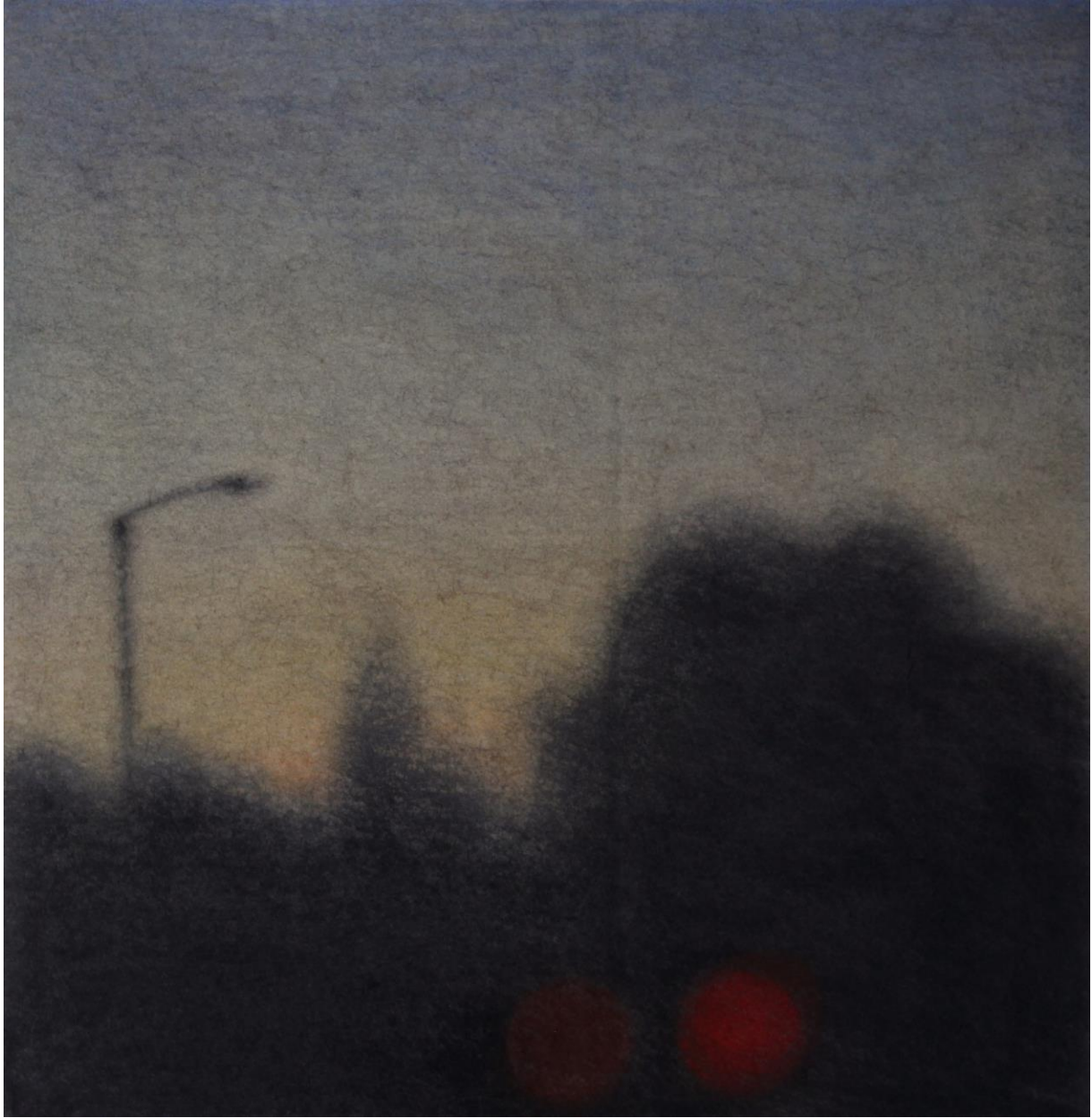
Figure 1: Setting Sun