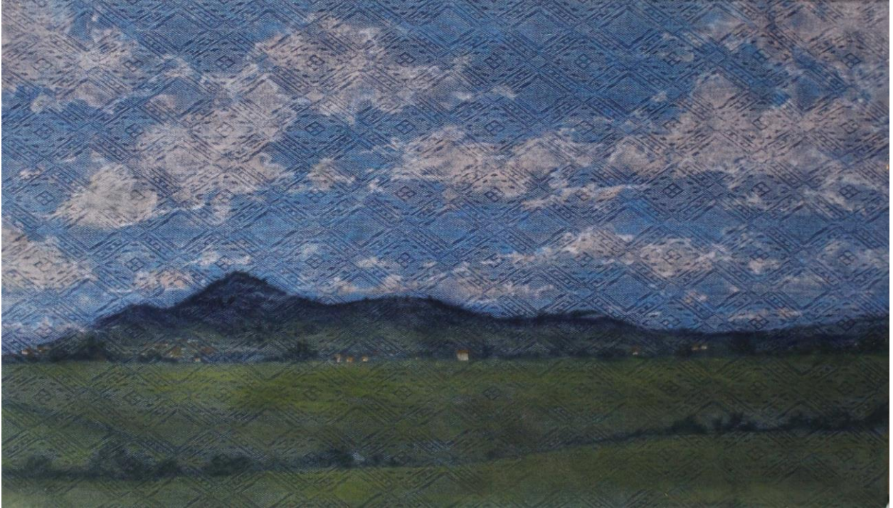
Figure 6: The Italian Way