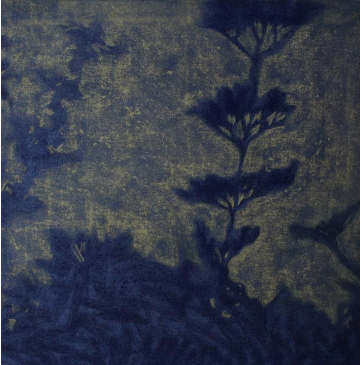
Figure 2: Cast In Gold