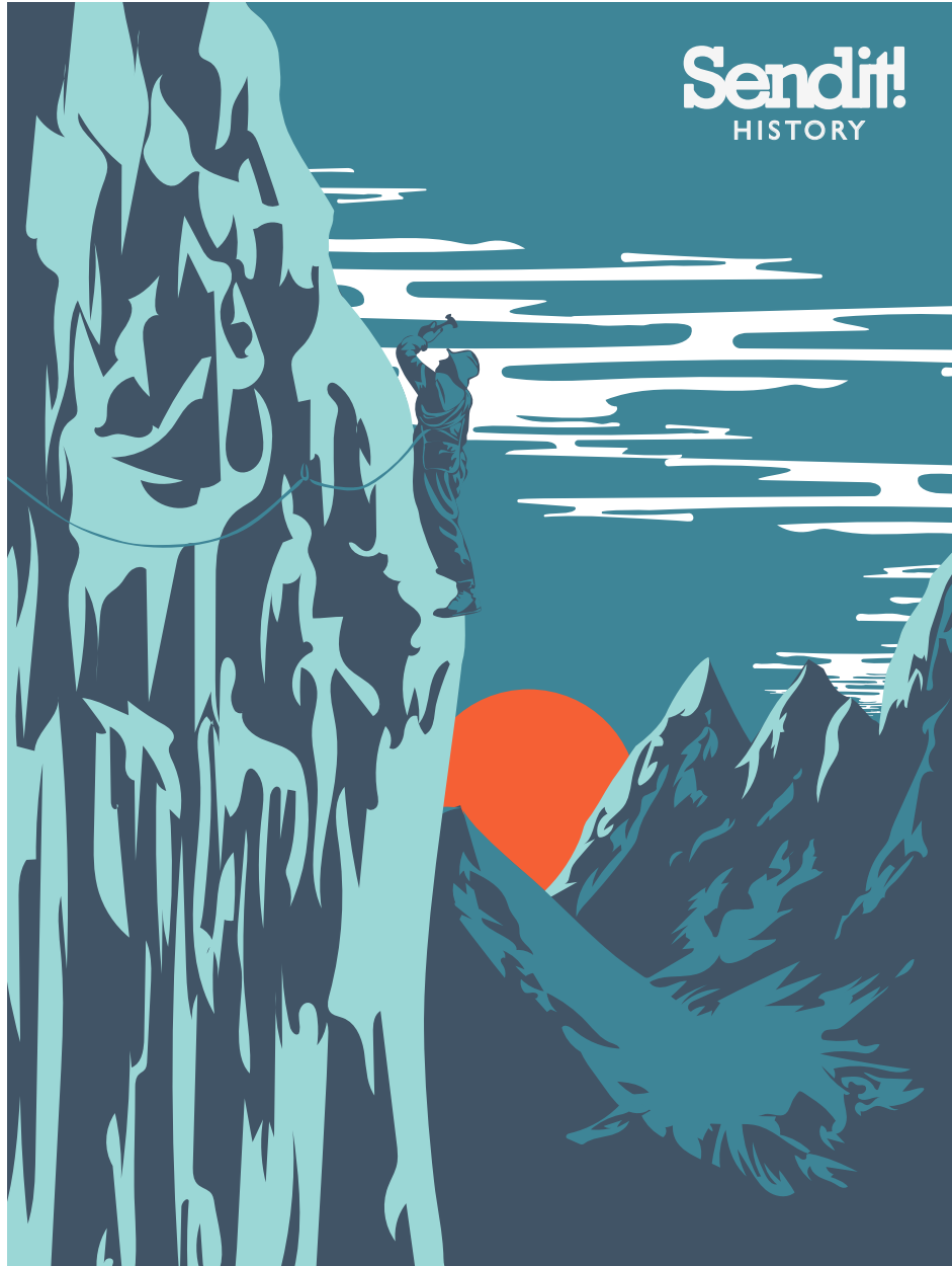
Figure 4: Sendit! History Poster