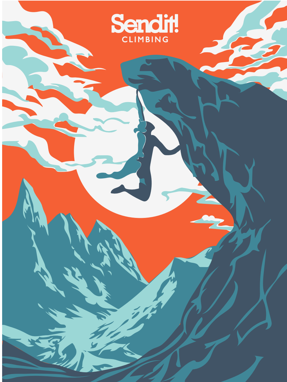
Figure 3: Sendit! Climbing Poster