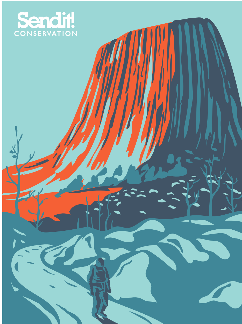
Figure 2: Sendit! Conservation Poster