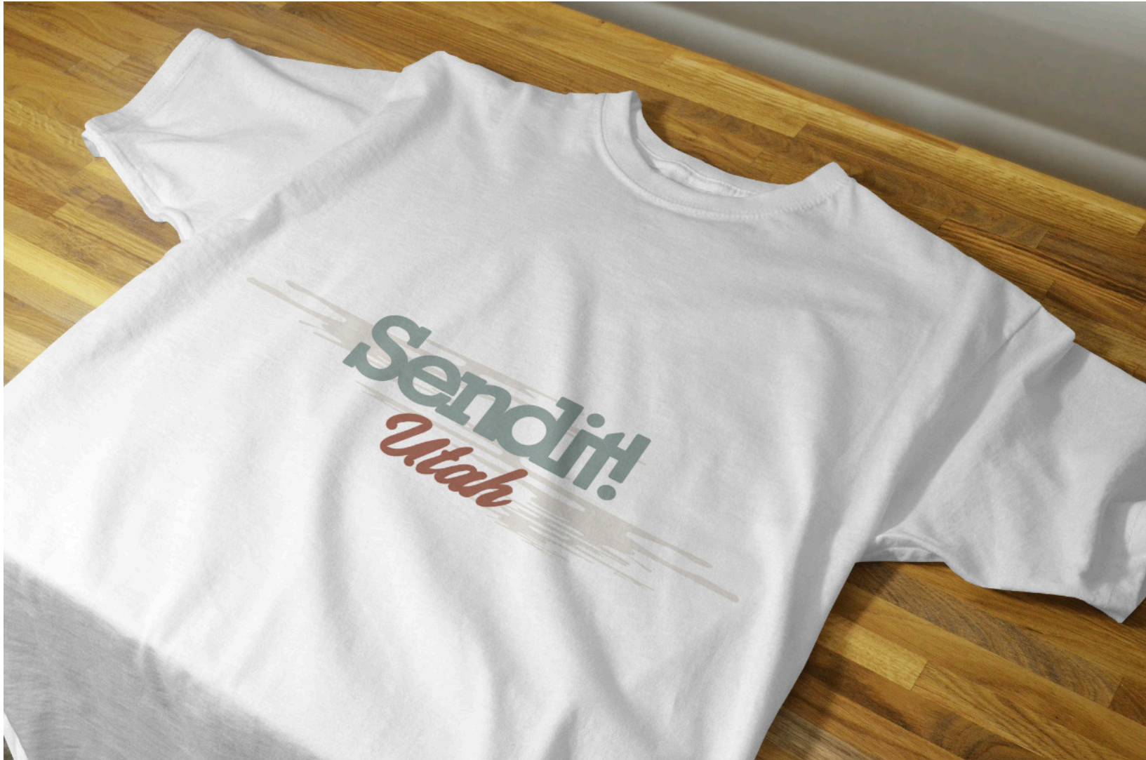
Figure 10: Sendit! T-Shirt Mock-