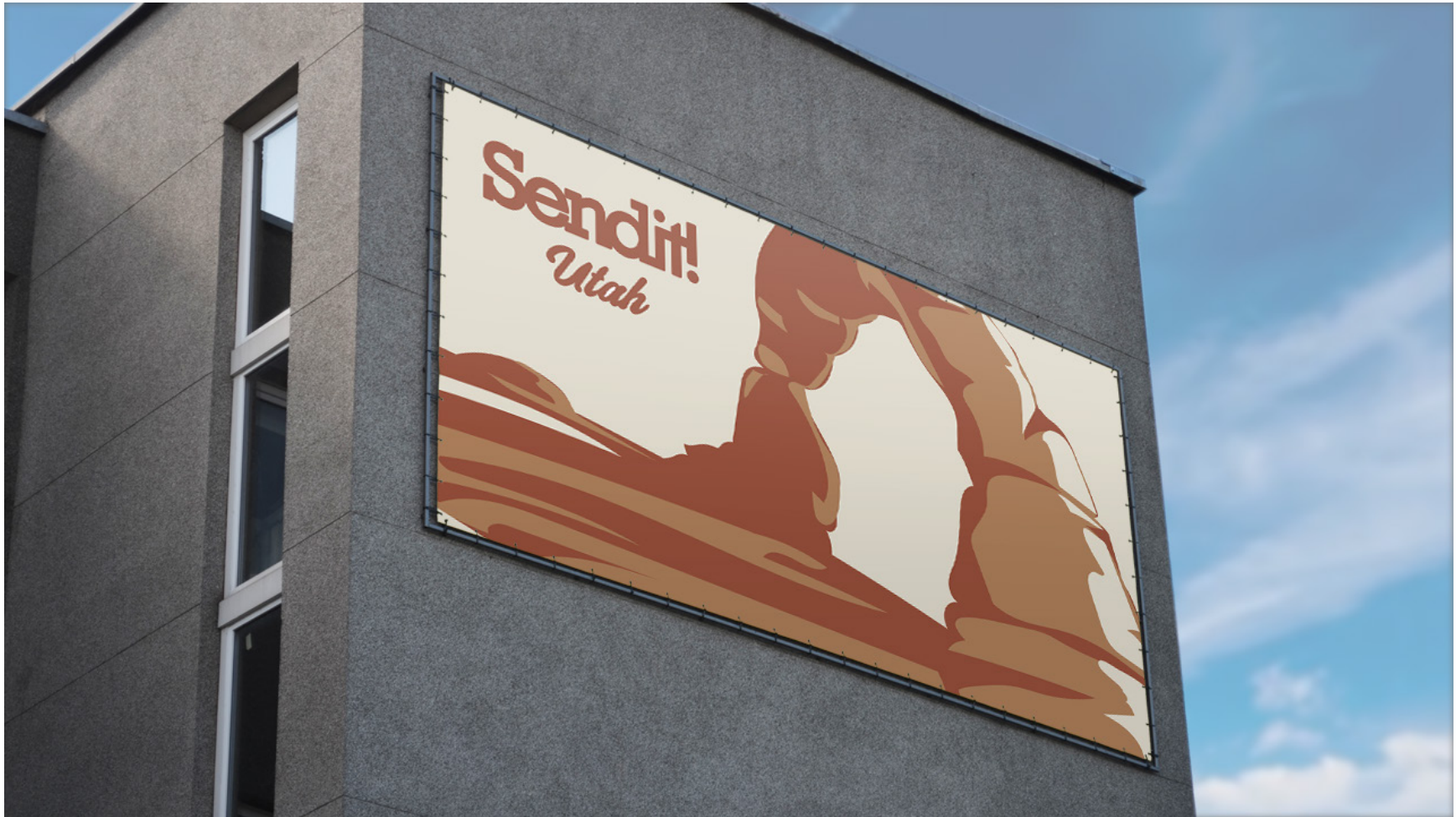
Figure 9: Sendit! Billboard Mockup