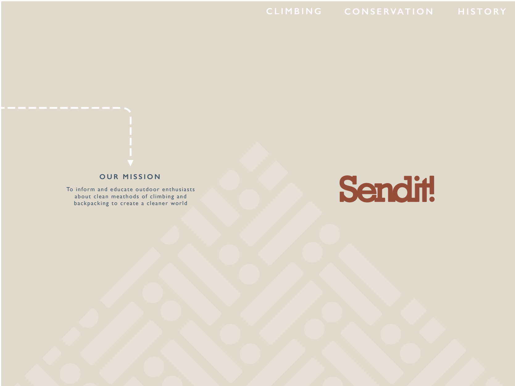
Figure 5: Catalog Front and Back Cover